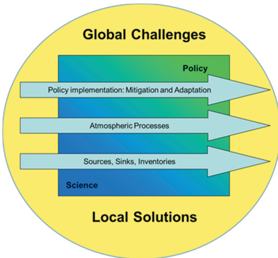
Figure 1. The scope of NCGG8 (conference image).

Climate change has often been referred to as the textbook example of a wicked problem (Levin et al. 2012). Several characteristics of wicked problems clearly apply to the non-CO 2 part of climate policy: incomplete or contradictory knowledge, i.e. uncertainty; the number of people and opinions involved; the interconnected nature of these problems with other problems (air quality, land-use), a solution possibly means new problems; and uncertainty of what defines a resolved problem. Non-CO 2 greenhouse