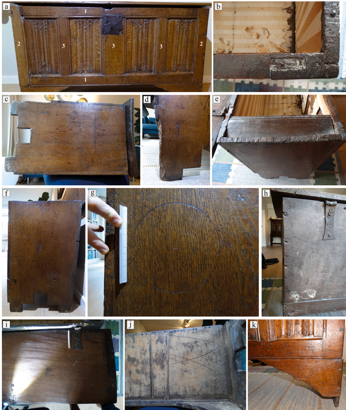
Fig. 2. Construction features. a) front of the chest with the linfold panels (numbers indicate: 1, rails; 2, stiles; and 3, muntins); b) tongue-and-groove join of the horizontal top rail to the right vertical stile; c) left side board, tangentially processed; d) heartwood/sapwood boundary is present on the lower back of the board; e) the transverse end at the top of the board is rough and unpolished, no nails are present; f) right side board, with a rough unpolished transverse end at the top (two nails are present but not in view here); g) circle of 14 cm diameter carved with compass; h) the back is made out of a wide tangential board and a narrow rail closing up the lower part; they are attached to the side boards with metal nails; i) tool marks on the inner side of the lid resulting from scraping the surface with a plane; j) partial mark on the underside of the left bottom board; k) right spandrel, which is fixed to the right side board with metal nails.

comparable distribution of matches, although these are less strong (Fig. 5b). The right side board however, has distinct stronger matches with sites near London, and one site to the north-east of London (Fig. 5c). Lastly, the lid shows stronger matches with sites along the Thames, west of London, and the strongest match with a site to the north-east of the city (Fig. 5d). Historical sites in London itself are often left out of the dendroprovenancing analysis, as from an early date (at least since the late 13th century; Galloway et al., 1996) London was pulling in timber resources from a wide hinterland. Moreover, it is not