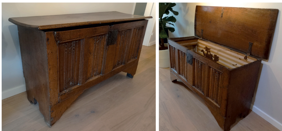
Fig. 1. Chest with linenfold panels.

side (Fig. 2j). Such thin bottom boards suggest that the chest was not meant to hold a heavy load.