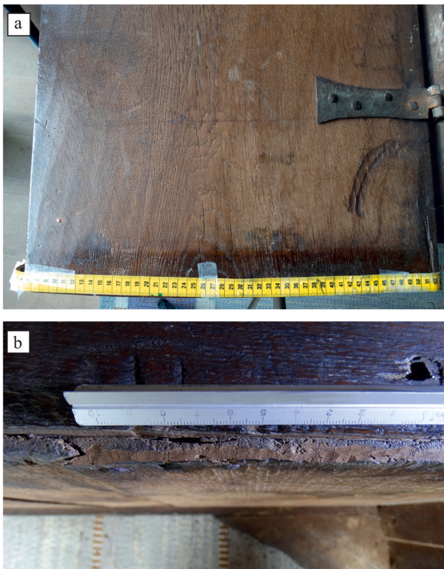
Fig. 3. Tree-ring acquisition. a) One of the parts of the chest (inner side of the lid) where tree rings were photographed in the transverse/radial section dendrochronological research; these measurements produced relative values; c) detail of the preparation with scalpel knives in the transverse end of the bottom middle board, where the V groove joint can be observed. These measurements represent absolute values.