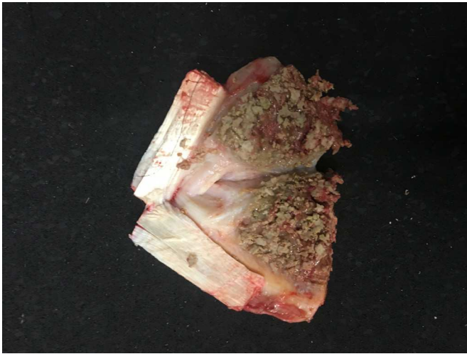
Figure 2 Cut surface of mass showing granular appearance of the centre of the lesion and infiltration of the superficial digital flexor tendon.

eosinophilic enteritis with eosinophilic infiltration of the submucosa and small numbers of lymphocytes and plasma cells.