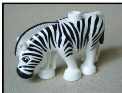
Fig. 1. Example of the visual stimulus ('Zebra has never been to Russia, and Dog has also never been to Russia')

sentence types 1 and 2 in Table 1) or referred to a different referent (shift conditions, sentence types 3 and 4 in Table 1).