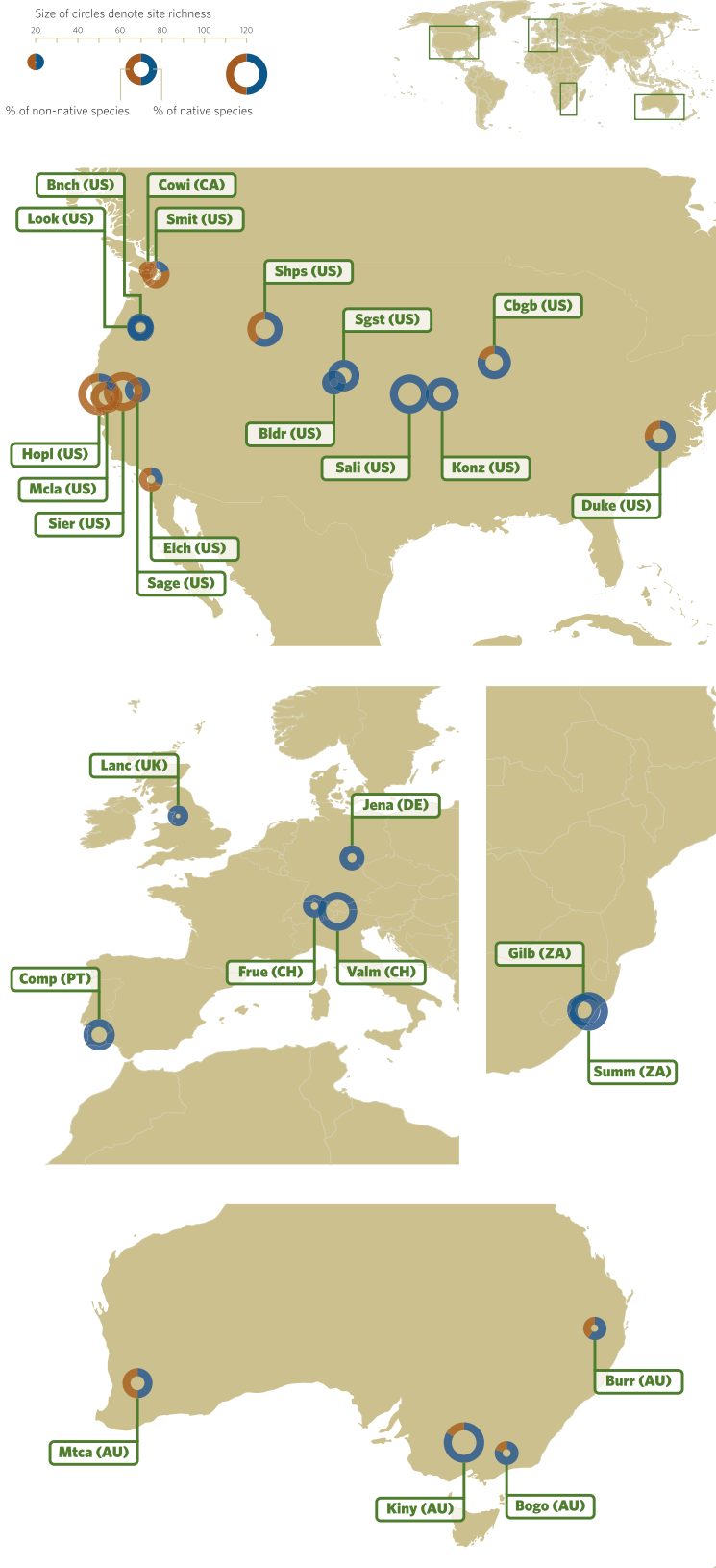
FIGURE 1 Global distribution of 27 sites (Bogo = Bogong, Bldr = Boulder South Campus, Bnch = Bunchgrass, Burr = Burrawan, Cbgb = Chichaqua Bottoms, Comp = Companhia das Lezirias, Cowi = Cowichan, Duke = Duke Forest, Elch = Elliott Chaparral, Frue = Fruebuel, Hopl = Hopland REC, Jena = JeNut, Kiny = Kinypanial, Konz = Konza LTER, Lanc = Lancaster, Look = Lookout, Mcla = Mclaughlin UCNRS, Gilb = Mt. Gilboa, Mtca = Mt. Caroline, Sage = Sagehen Creek UCNRS, Sali = Saline Experimental Range, Shps = Sheep Experimental Station, Sgst = Shortgrass Steppe LTER, Sier = Sierra Foothills REC, Smit = Smith Prairie, Summ = Summerveld, Valm = Val Mustair) in eight countries (AU = Australia; CA = Canada; CH = Switzerland; DE = Germany; PT = Portugal; UK = United Kingdom; US = United States of America; ZA = South Africa), across four continents. Percentage of dominant native (blue) and non-native (orange) species sampled at each site is shown in rings. Ring size represents the total site-level species richness (native and non-native), which ranged from 21 (old field 'Cowi', CA) to 109 (annual grassland 'Hopl', US; see also Supporting Information Table S1)

10 g P/m 2 /year as triple-super phosphate; 10 g K/m 2 /year as potassium sulphate and 100 g/m 2 /year of a micro-nutrient mix (Fe, S, Mg, Mn, Cu, Zn, B, Mo, Ca). The N, P and K fertilizers were applied annually whereas the micro-nutrients were applied once at the start