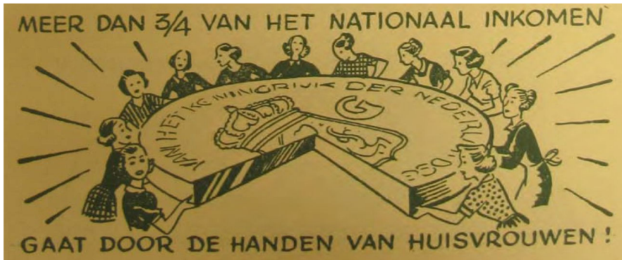
Picture 4 – Illustration of the crucial financial role of housewives (1960)

In 1951, the Gezins Begrotings Instituut (Institute of Household Budgets, henceforward: GBI) was established. It published numerous information booklets forming as it were the domestic science schools, a reflection of the strict gender division of labour. For instance, in 1955 the GBI published a booklet on budgeting, starting with the message that “the man earns the money for his family and the woman spends it” (Wilzen-Bruins, 1955: 4). The author urged her fellow housewives that the way in which they managed their finances could mean the difference between a peaceful family life and a tense home environment where the spouses always fight. Thus, so she stated, “[i]t is our [ i.e. housewives] duty to spend the money that our husbands earn wisely. [...] That is our duty to our family. A difficult task for most of us” (Wilzen-Bruins, 1955: 14-15). Picture 2 – taken from the same booklet – conveys the message that three quarters of the national income went through the hands of housewives. Whether or not this is an adequate estimation (three quarters is probably an exaggeration), the message of this picture is clear: the financial competence of housewives was vital to keep society running.