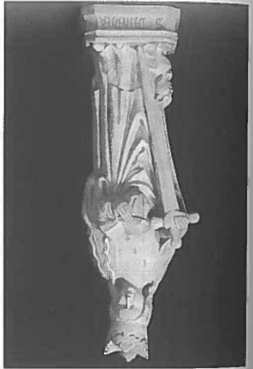
Figure 18.1 Statue of Dymrna

Here were the young women of the highest intelligence, and the most daring and ingenious of them, coming out of the chiascuro of a thousand years, blinking at the sun and wild with desire to try their wings. I believe that some of them put on the armour and the halo of St Joan of Arc, who was herself an emancipated virgin, and became like white-hot angels.