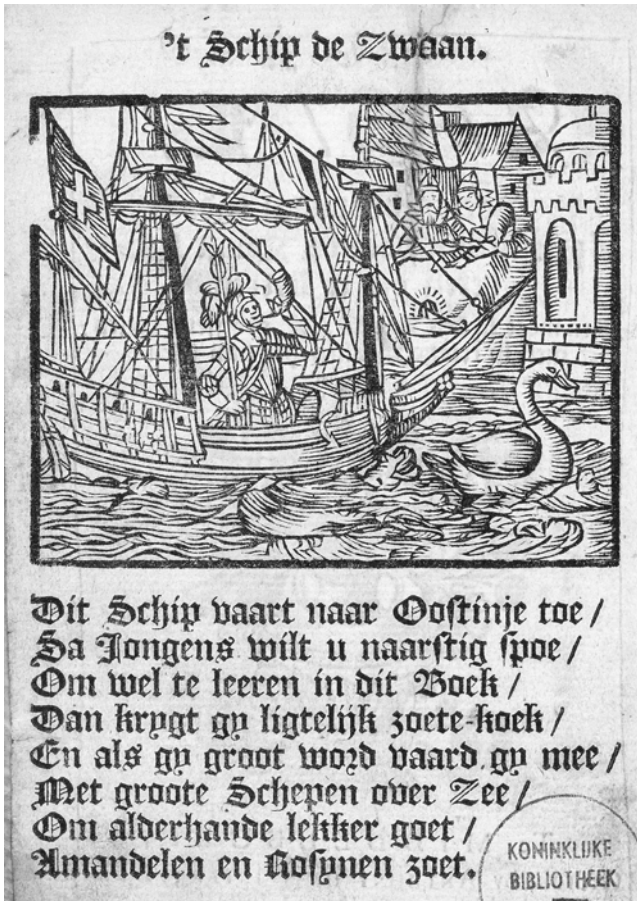
Figure 2. Een A,B,C, boek, bequaam ende profijtelijk voor de jonge kinderen om te leeren, opening poem.

the second one answered: Oh I know it! I know it! The See is a big piece of white paper , while he opened his eyes wide, and stretched his little hands as far as he could” (ibid.). 10