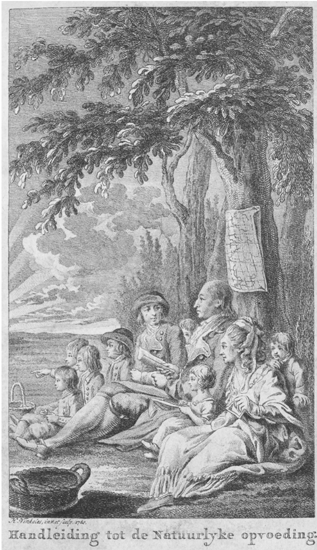
Figure 3. Campe, Handleiding tot de natuurlyke opvoeding of Robinson Crusoe , p. 11r

contains, depicts the readers' travel guides: the children (fig. 3). The reader catches them when they are listening to Robinson's story, told by father who holds the book in his hand. Children and adults are settled in the garden, since father prefers a direct – unmediated – observation of the natural world: "it would be a pity to see such a nice evening through glasses" (Campe 1780-1781, Introduction). 15 All protagonists line up and observe the natural environment right before them – one of the children even points its finger to highlight this collective observation process. The meaningful opening scene makes young readers aware of a radical merging of reading ("reading about"), observing ("seeing") and travelling within Campe's Robinson Crusoe , and thus presents reading as an unmediated practice of seeing places.