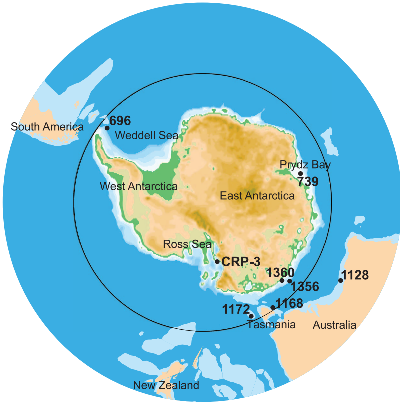
Fig. 1. Antarctic topography [modified after (33), maximum topography model], circum-Antarctic paleogeography at 34 Ma (34) and the location of sites considered in this study. Light blue areas represent shelf environments; green areas represent Antarctic lowland areas. The black circle indicates 60°S.

continental-scale glaciation of Antarctica at O11 includes the appearance of ice-rafted debris and physically weathered clay minerals at sites along the Antarctic margin (5, 6). Numerical climate model simulations suggest that partial to full-scale glaciation of Antarctica occurred after a reduction in atmospheric CO 2 concentrations and a series of low-amplitude orbital variations in solar insolation that resulted in relatively cool austral summer temperatures (7). Such conditions, as well as continental ice, were also likely required for seasonal sea-ice formation (7). As a consequence, the establishment of Antarctic glaciation should have substantially impacted circum-Antarctic Southern Ocean ecosystems, and associated biotic changes are potentially reflected in the fossil record in conjunction with the O11 climate event.