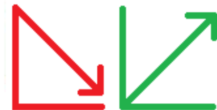
Figure 3 Red arrow down and green arrow up.

The MHC-SF is a self-report questionnaire measuring treatment outcomes in terms of positive mental health. The MHC-SF is based on a long version (MHC Long Form), which consists of 40 items. 48 Its short form contains 14 items and includes three components of well-being: Emotional (3 items), Psychological (6 items) and Social Well-being (5 items). The items are scored on a 6-point scale ranging from never (0) to every day (5). The sum of the three scale score represents the respondent's experience of overall positive mental health. Emotional well-being is about life satisfaction and positive feelings, such as happiness, interest and pleasure in life. 49 Psychological and social well-being focus on the optimal functioning of people rather than on the experience of satisfaction and happiness. Psychological well-being