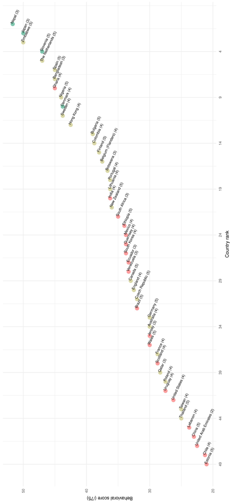
Figure 2 — Plot of the behavioral score estimated for the 49 countries of the Global Matrix 3.0. Note: The behavioral score was adjusted for missing and incomplete grades. The number in parenthesis shows the number of grades available for the calculation of the score.