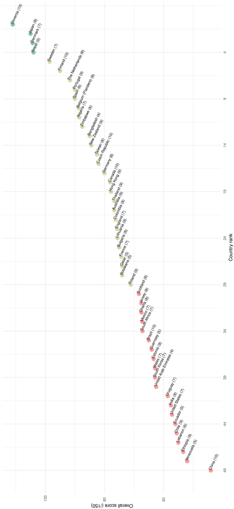
Figure 1 — Plot of the overall score estimated for the 10 core indicators for the 49 countries of the Global Matrix 3.0. Note: The overall score was adjusted for missing and incomplete grades. The number in parenthesis shows the number of grades available for the calculation of the score.