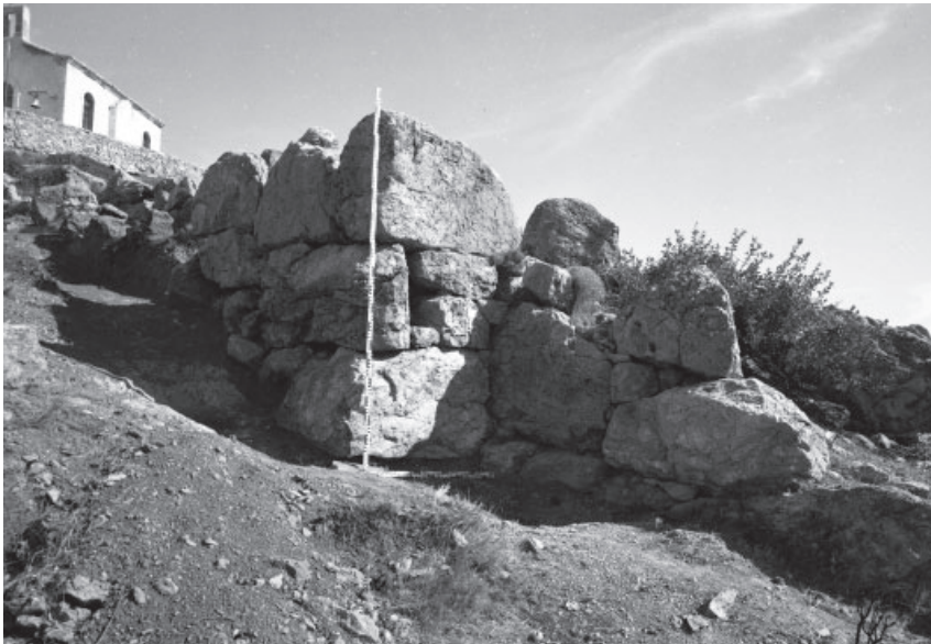
South corner of stairs (T) and ramp with Aghios Nikolaos in the background, seen from the west (Thorikos archive, photo: H. Mussche).

second phase, its walls were reinforced to a thickness of two meters, and it was transformed into a cistern.