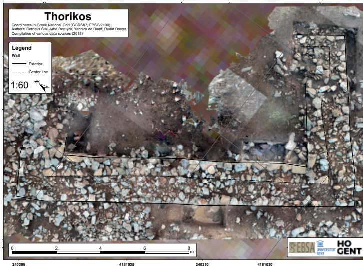
Orthophotograph of rectangular structure of the late 5th century BC.

References: Dodwell 1819; Mussche 1961; McCredie 1966, 33-34; Mussche 1998, 6, 16-17, 60, 101, fig. 19; Labarbe 1977, 25; Apostolopoulos et al. 2014.