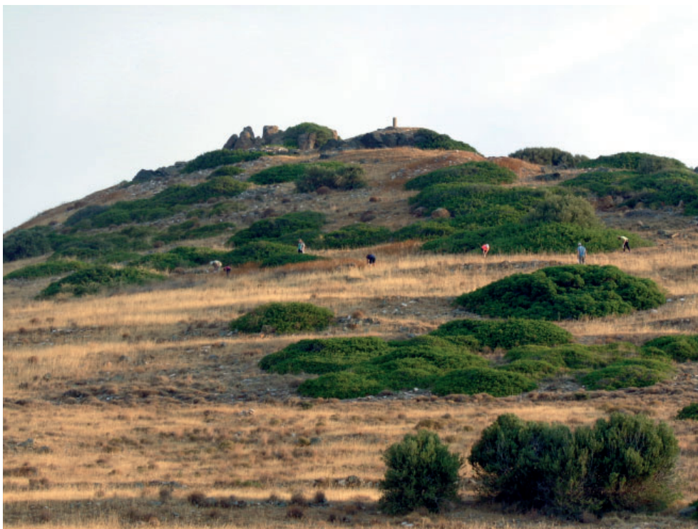
Archaeological survey on the southeast slopes of the Velatouri.