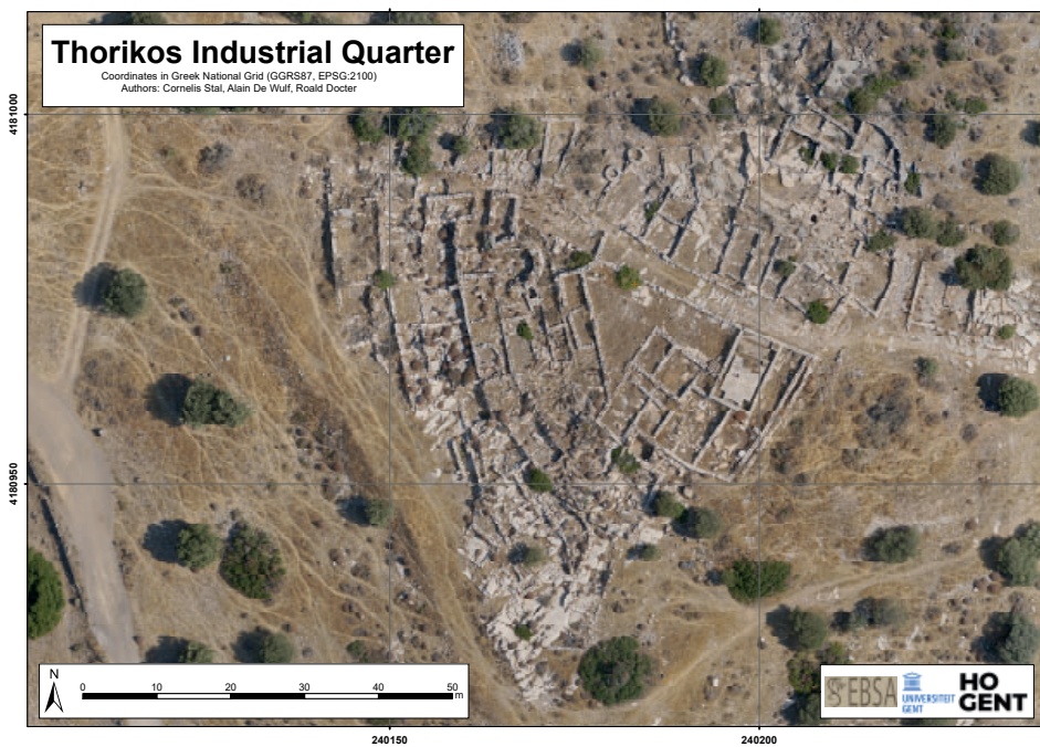
Orthophotograph of the Industrial Quarter