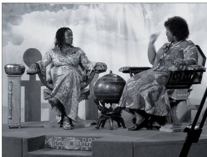
Dbaa Mbo talk show, TV Africa.