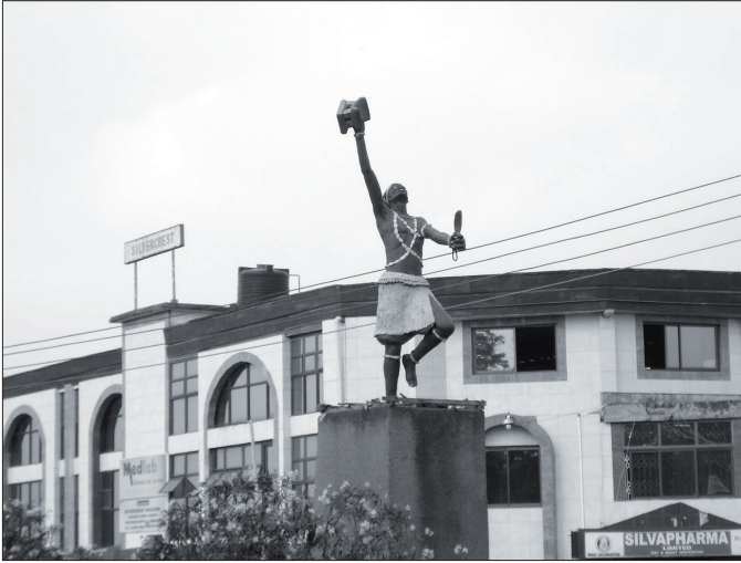
Statue of Okomfo Anokye in Kumasi before it was demolished.