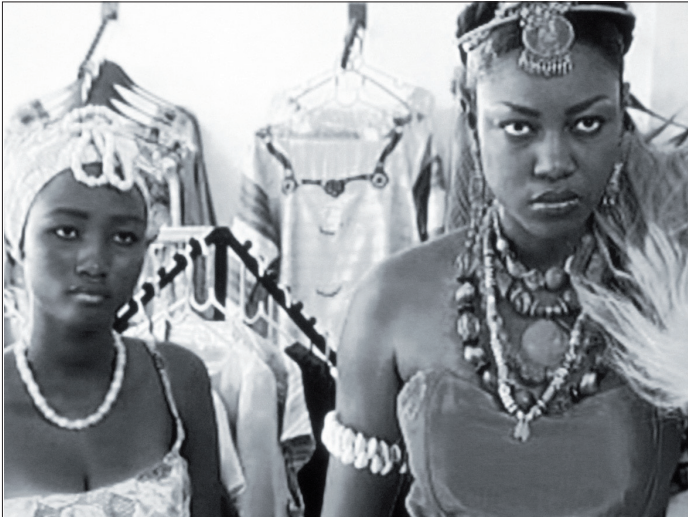
Video still from Princess Tyra.