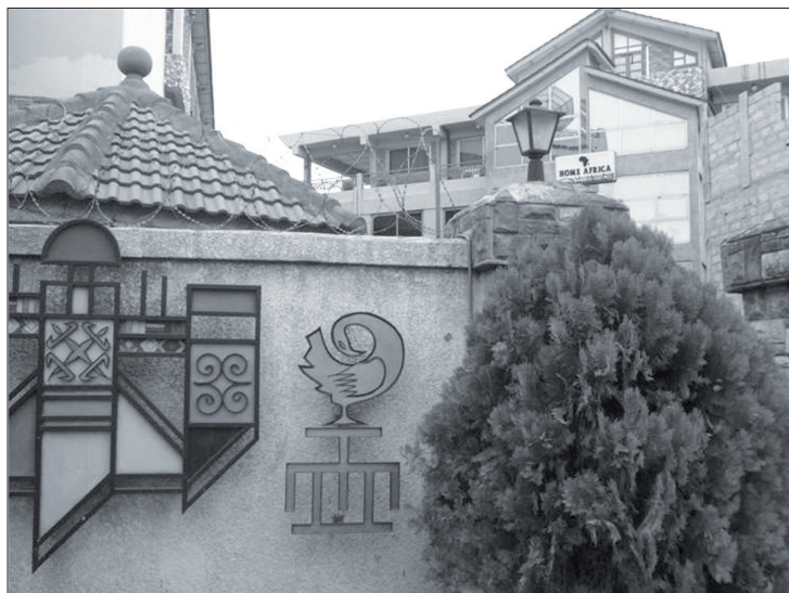
Sankofa symbol on the fence wall of the TV Africa studios, Accra.