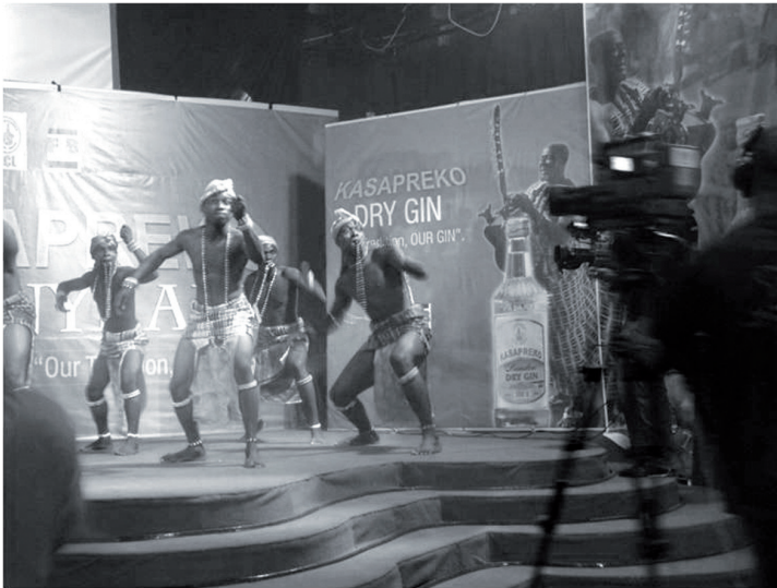
Omanyaba reality show, TV Africa.