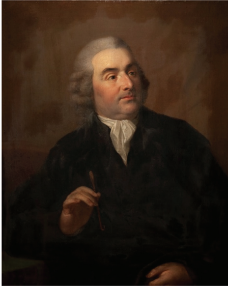
Fig. 1: Johann Heinrich Wilhelm Tischbein, Petrus Camper , 1788. Groningen University Museum.