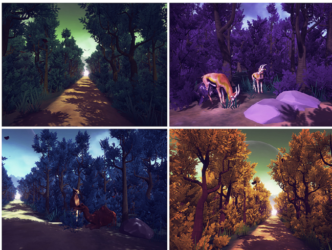
Fig. 1. Screenshots of the VR (baseline) environment that participants moved through while walking on the treadmill.

The VR application was developed in collaboration with Triple (Alkmaar, the Netherlands) and Gamedia (Alkmaar, the Netherlands). The VR headset we used was the first consumer edition of the Oculus Rift (Oculus VR; Menlo Park, California) and the PC we used to run the application on was equipped with an NVIDIA GeForce GTX 1070 graphics card (NVIDIA; Santa Clara, California). This allowed the application to run at a high frame rate