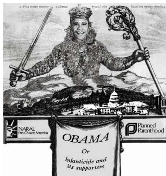
Fig. 7: Obama cast as Leviathan.

Attack on Leviathan in which he criticized the interference of the state. 31 In 1987, the traditional liberal Robert Higgs phrased his criticism of the American government in Crisis and Leviathan: Critical Episodes in the Growth of American Government . 32 Much of the Republican rhetoric in the United States – especially from members of the Tea-party – against a meddling government is based on this publication. In the criticism against the plans of Barack Obama to construct a better system for health-care, the former president is often compared with the Leviathan. In that connection various cartoons appeared in which Obama is depicted as a present-day Leviathan by copying his image in the front page of Hobbes' work. This image is very suggestive.