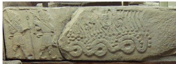
Fig. 2: The Hittite Sky God Teshub kills the dragon Illuyanka (relief from Malatya; 9. Jh. v. Chr.).

In the Old Testament, the Leviathan occurs six times: twice in the Psalms, twice in the Book of Job, and twice in the prophecies of Isaiah. 3 Remarkably, the fabulous creature is only attested in poetic texts and never in a narrative context. The image of Leviathan as well as the symbolic meaning of the mythological animal is not constant or equal in the six passages. An unequivocal picture of the Biblical Leviathan cannot be drawn. Sometimes, he is a snake, sometimes a crocodile of gigantic proportions, and sometimes a dragon of the sea. It is intriguing to see that this multifaceted image of Leviathan has implications for the reception of the animal throughout history. At the various stages of human history, the monster plays a different role. 4