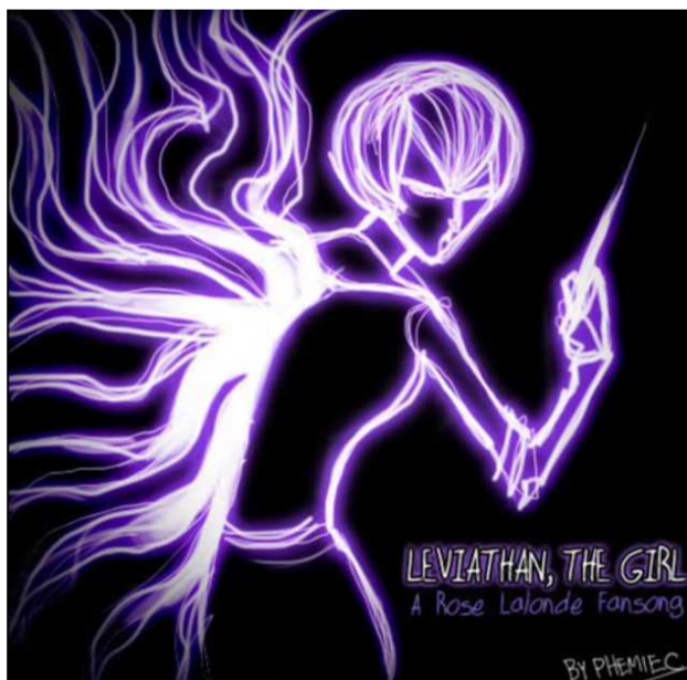
Fig. 9: Cover of PhemieC Leviathan .

In literature an almost endless row of Leviathans occurs. The monster is present in serious novels 50 , in poetry 51 , in a detective 52 , in children's books 53 , and in science fiction. 54