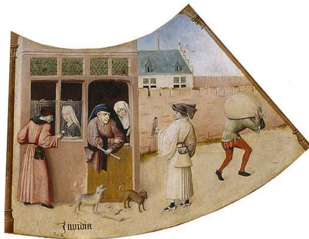
Fig. 8: Hieronymus Bosch (ca. 1450–1516), Invidia as one of the seven mortal sins. 34

It would – despite the remarks of Zvyagintsev himself in the interview – be better to look at another possible thematic connection. Above, it is made clear that in the medieval doctrine of the seven deadly sins, Leviathan is the demon connected with invidia , envy, greed and avarice. According to pope Gregory I invidia was one of the seven cardinal sins. 35 Leviathan is the demon that accompanies this sin. On various levels of the story, Zvyagintsev's movie is full of themes such as desire and greed. To give a few