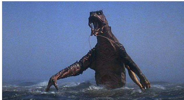
Fig. 4: Leviathan scene in the Movie by Cosmatos.

Sixpack awakes seriously ill the next morning. The expedition doctor Doc finds injuries on the back of Sixpack, who dies a few hours later. When Bowman gets sick and dies too, panic breaks out. A violent storm makes a direct evacuation impossible. Out of fear the corpses are thrown outside. As they disappear into the sea, they mutate. At the same