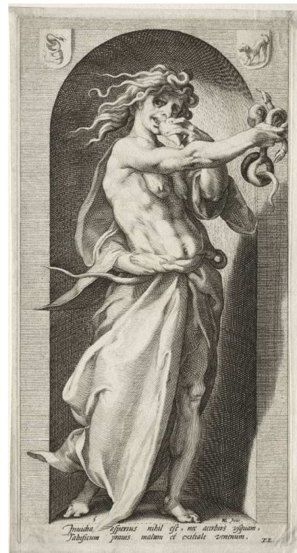
Fig. 3: Invidia by Jacob Matham (after Hendrik Goltzius; etching, 1593).