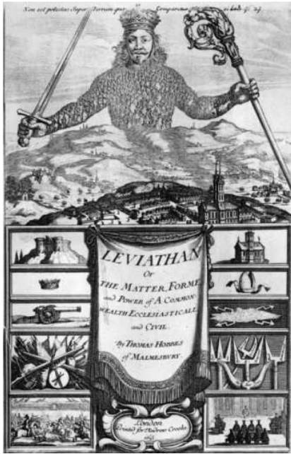
Fig. 6: Frontispiece of the original edition of Hobbes' Leviathan (engraving by Abraham Bosse, 1651).

Attack on Leviathan in which he criticized the interference of the state. 31 In 1987, the traditional liberal Robert Higgs phrased his criticism of the American government in Crisis and Leviathan: Critical Episodes in the Growth of American Government . 32 Much of the Republican rhetoric in the United States – especially from members of the Tea-party – against a meddling government is based on this publication. In the criticism against the plans of Barack Obama to construct a better system for health-care, the former president is often compared with the Leviathan. In that connection various cartoons appeared in which Obama is depicted as a present-day Leviathan by copying his image in the front page of Hobbes' work. This image is very suggestive.