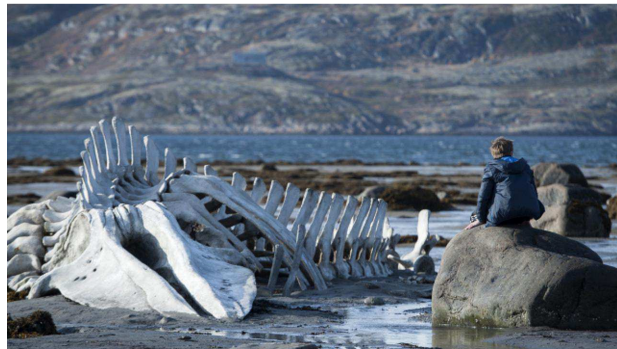
Fig. 5: Roman sees a skeleton of a whale.