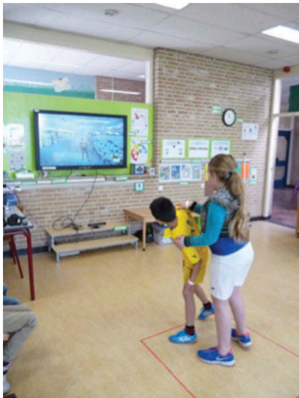
Figure 2. One couple playing the game.

The ice-skating game used in this study is a game originally developed to train the balance of older adults. The game was created by research center SPRINT at the University Medical Center of Groningen in collaboration with the game company 8D games [see http://www.imdi-sprint.nl/huidige-projecten/exergaming-project/ ]. The game runs on a mini-PC which connects to any modern television and is controlled using infrared sensor technology [Kinect v1 Microsoft Corp, Redmond, USA]. In the game, the user controls the speed and direction of a virtual ice skater on a frozen canal by shifting his or her bodyweight in both lateral directions (see Figure 1). Thus, the players control the avatar [skating figure]