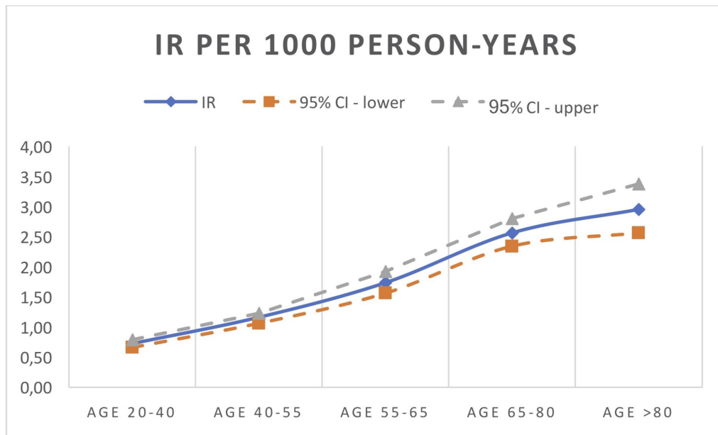
Figure 2 Incidence rate of superficial venous thrombosis according to age. IR, incidence rate.

an average period of 10 years. In the Netherlands, all citizens are registered with a GP, irrespective of cooperative care from a medical specialist, including patients living in a home for the elderly, but with the exception of those living in a nursing home or hospice. This study population is therefore a representative and complete sample of people from the community.