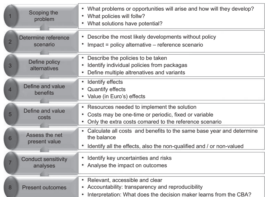
FIGURE 1 Research steps of a Social Cost-Benefit Analysis (adapted from (Romijn & Renes, 2013))

For Dutch government decisions that involve several domains of society, SCBA is the recommended analytical technique. The study will be performed according to the Dutch general guidelines for SCBAs