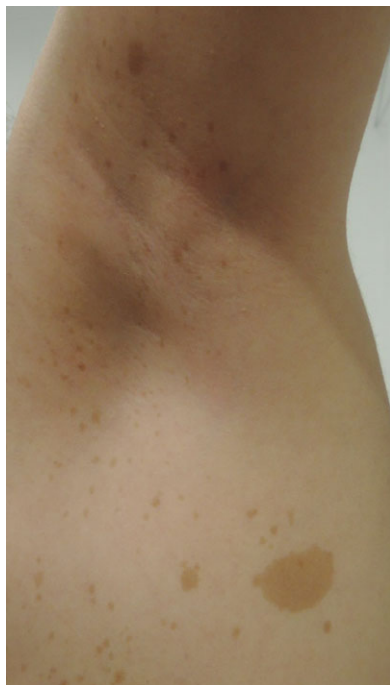
FIGURE 1 Axillary freckling and a café-au-lait macule in the child. [Color figure can be viewed at wileyonlinelibrary.com]

A 3-year-old girl, the child of first cousins, was referred by her pediatrician for genetic evaluation. With more than 6 CALMs (size between 1.5 and 2.5 cm) and freckling under the left axilla, she fulfilled the clinical criteria for NF1 (Figure 1). Prior to her referral to our department, analysis of NF1 and SPRED1 was performed by Sanger sequencing from genomic DNA and multiplex ligation dependent probe amplification (MLPA), but no mutations were found. To further rule out any gross chromosomal rearrangements involving the NF1 locus on chromosome 17 we performed karyotyping. Both parents