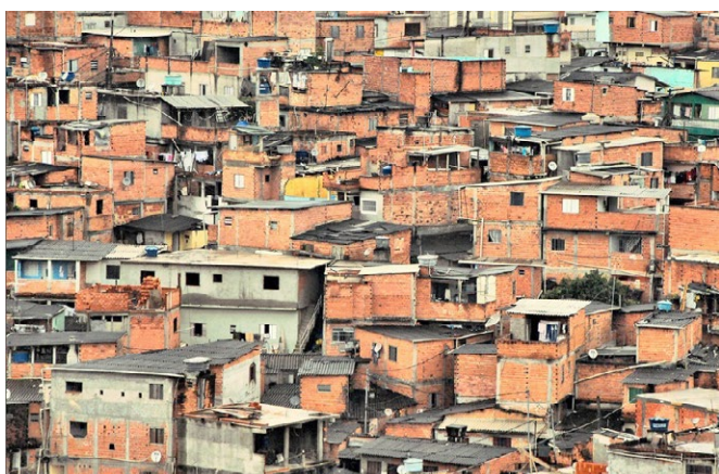
Figure 2 Favela in Brazil