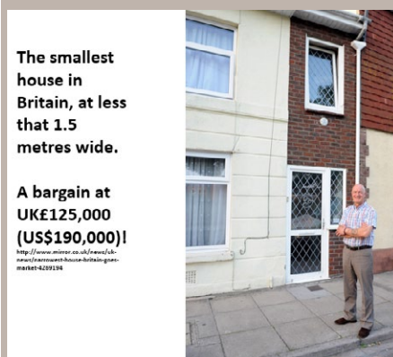
Figure 1 The smallest house for sale (Geoffrey Payne)

Payne showed an image of a man in the United Kingdom standing outside his 1.5 metre wide house in London which was on sale for £125,000 (fig 1). He used this example in a presentation for Ugandan government officials, who insisted that plot sizes of 150 m 2 were needed, even though this would make it impossible for a large proportion of Kampala's population, many of whom lived on plots of about 60m 2 , ever to become legal residents.