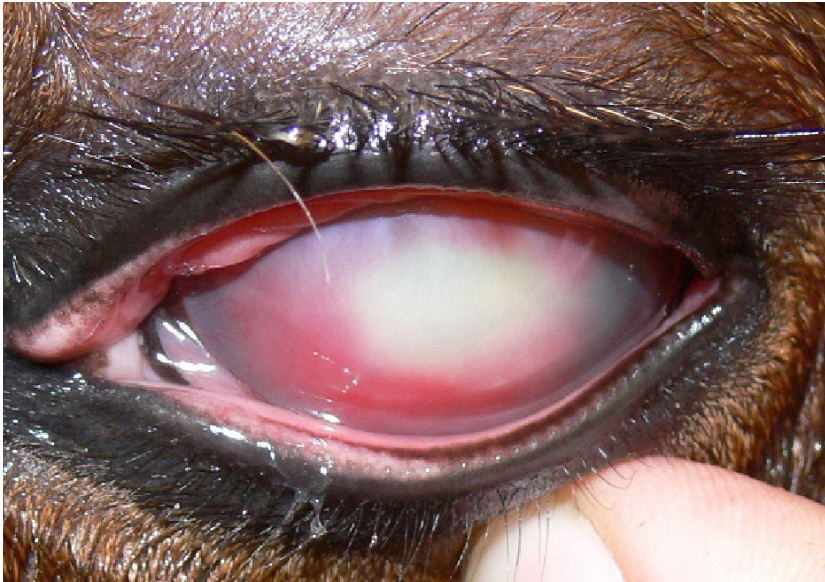
Fig 2. Suspected keratomycosis with stromal abscess without corneal ulceration.