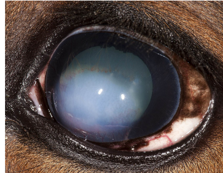
Fig 3. Corneal scarring after treatment with miconazole of a stromal abscess caused by equine keratomycosis.