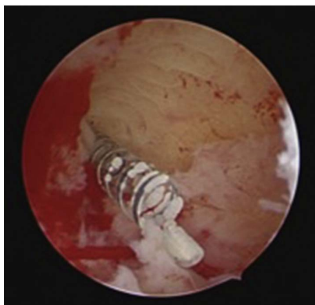
Fig. 1. Hysteroscopic view of right tubal ostia. The outer (nitinol) coil of the Essure device with a white deposit is visible. (Color figure).

the devices, together with a change in menstrual cycle. She reported longer and heavier menstrual bleeding. Results of gynecological examination and X-ray imaging of the pelvis showed no abnormalities.