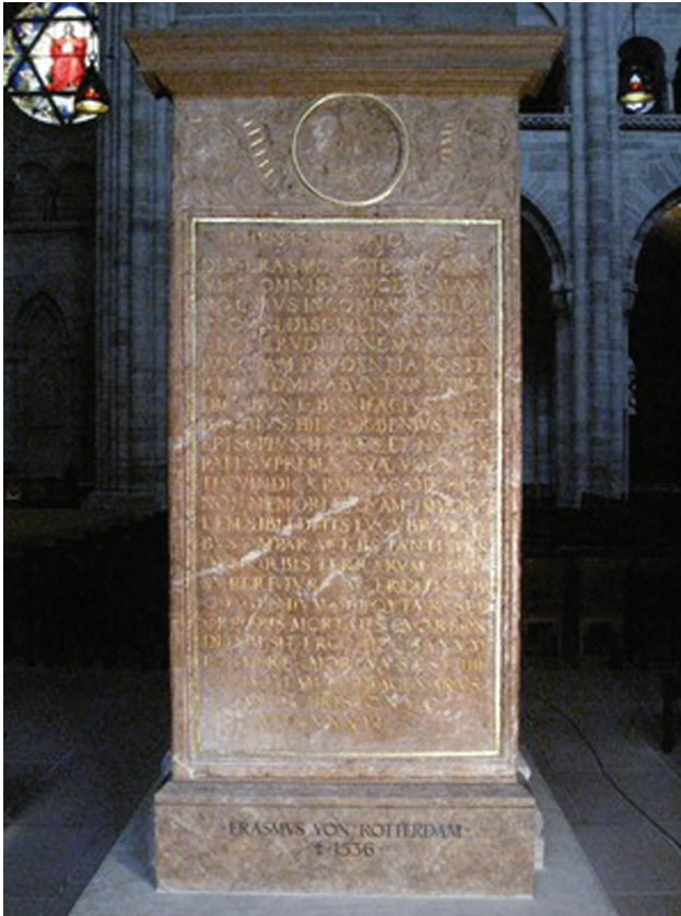
Fig. 1 Memorial monument to Erasmus in the Munster Cathedral in Basel, where Erasmus was buried in 1536.

of which he paid alms to the poor and granted students scholarships. The latter task made him into an extremely well sought-after man, who dispensed numerous scholarships to Protestants and Catholics alike. 53 What exactly Trommius saw remains unclear: he may have mistaken Amerbach's library for Erasmus's; maybe he misunderstood or misremembered the German explanation of the two women.