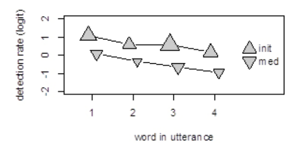
Figure 1: Detection rates of single-segment errors, broken down by word position and by within-word position of the error. Symbol size corresponds to numbers of errors in each cell.

The detection rates of speech errors are summarised in Figure 1. One may note that the total number of single segment errors is lower for medial than for initial position.