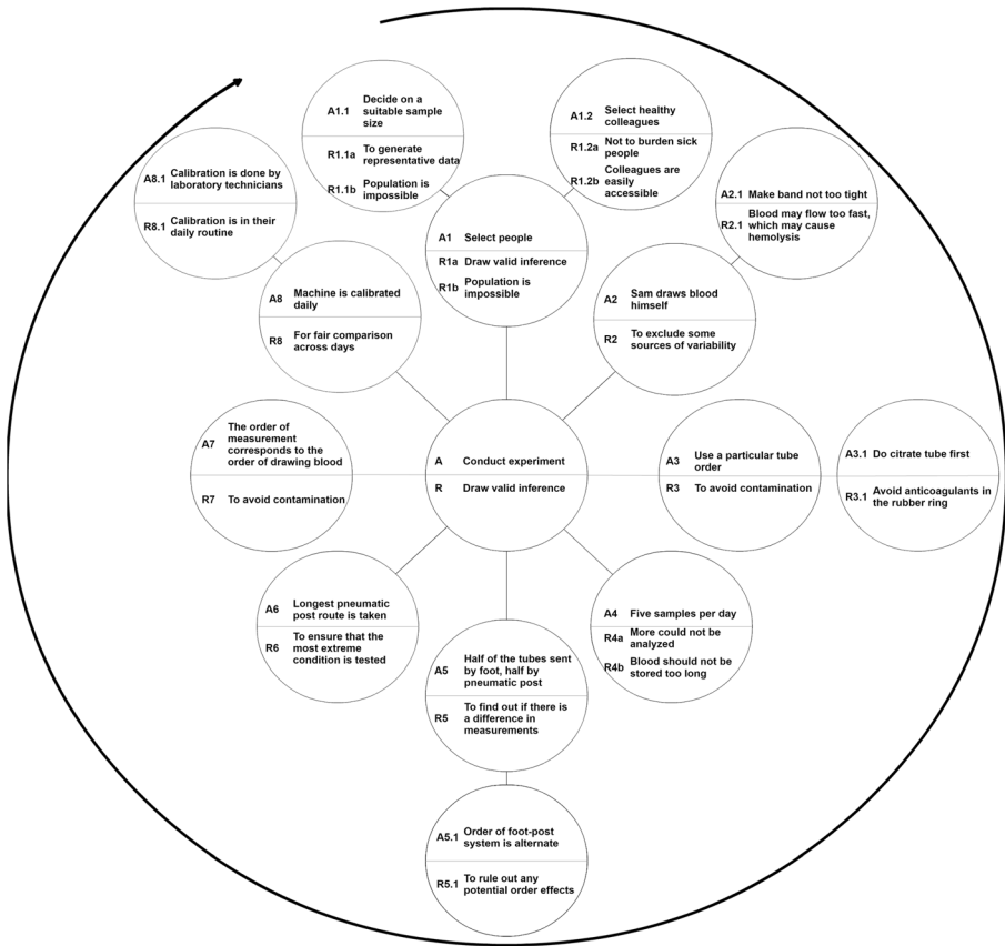
Fig. 1 A web of reasons and actions involved in Sam’s experiment. A stands for action and R for reason. The action-reason combinations are presented clockwise in chronological order. The more detailed action-reason combinations are presented more toward the periphery