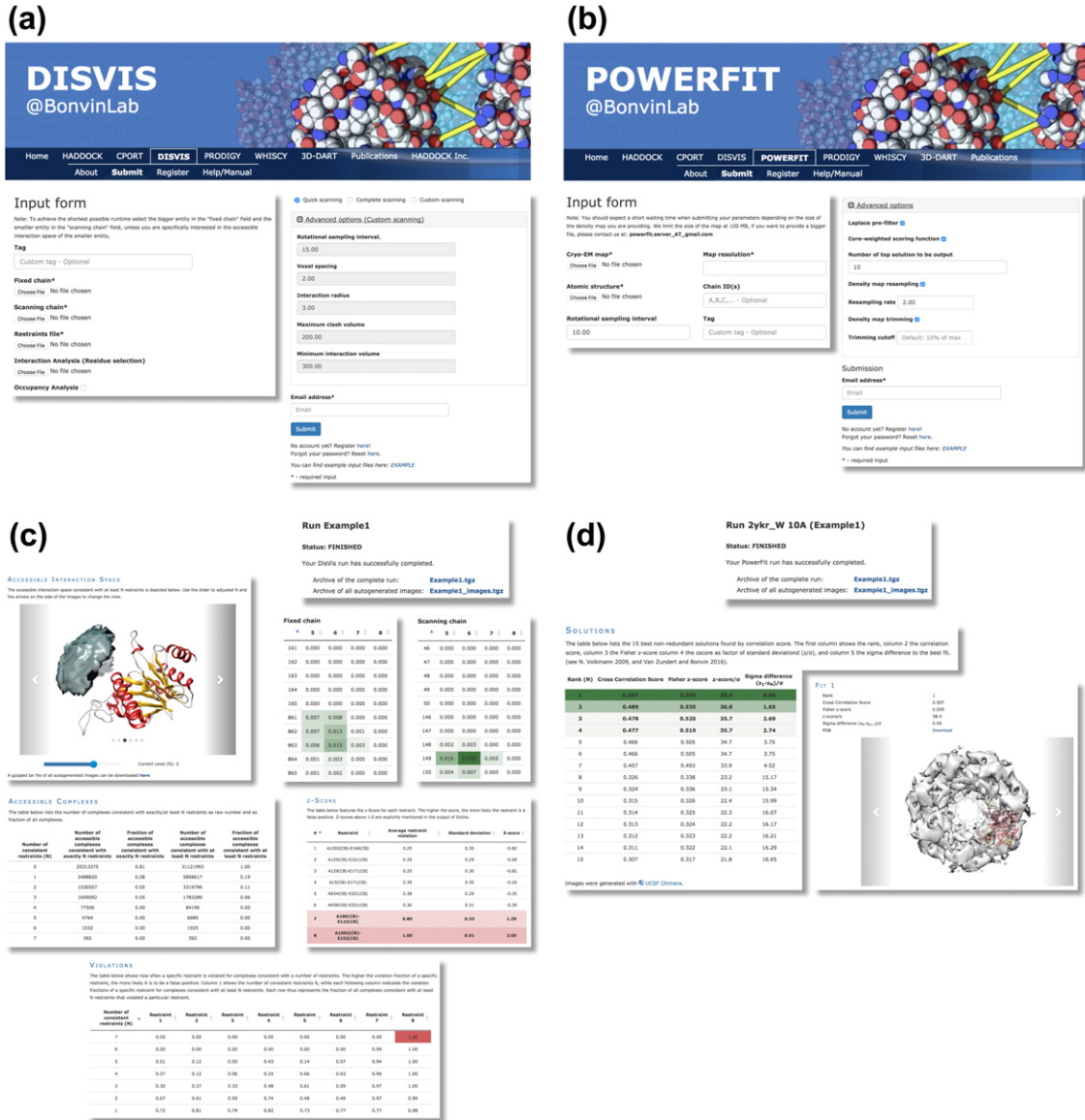
Fig. 2. Excerpts from the submission (top) and results (bottom) pages of (a and c) DisVis and (b and d) PowerFit.