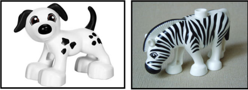
Fig. 1. Example of a visual stimulus ( Zebra nikogda ne byla v Rossii, i Sobaka tože nikogda ne byla v Rossii 'Zebra has never been to Russia, and Dog has also never been to Russia').