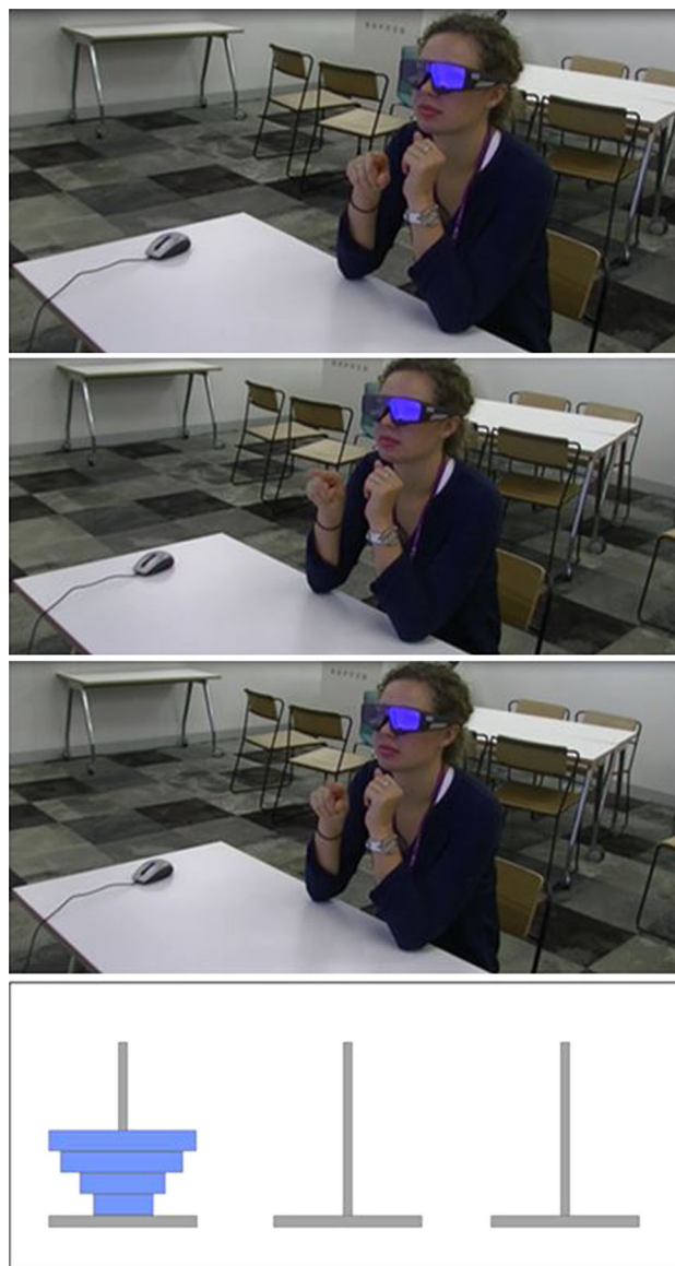
Fig. 1 Example of gesturing during the mental solving phase (1 s per frame). To show where participants look at during gesturing, the last frame is an example of the static Tower of Hanoi presented for 60 s during mental problem solving (inverted rules condition)

Gesture Participants' video data per task were coded for gesture frequency (for an example see Fig. 1). Due to camera malfunction, we could not count gestures of two participants. Gestures were defined as any hand movement of one or both hands from one still point to the next, indicating the travel of a disc from one peg to another (see Garber and Goldin-Meadow 2002). All participants used index-pointing gestures. The first two authors independently counted the gestures, and interrater reliability was high, Pearson's r = .89, p < .001 .