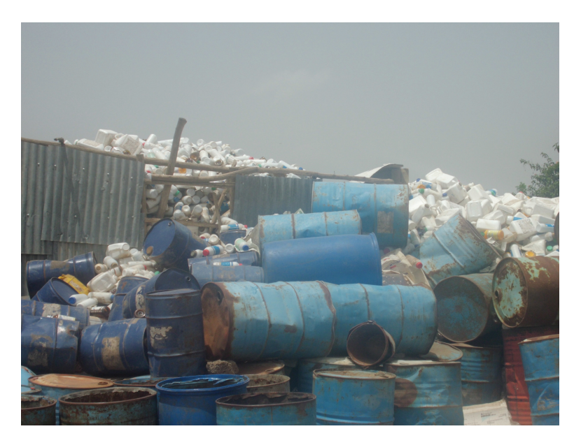
Figure 2 Disposal of discarded empty pesticide containers collected in one of the large scale open farms.