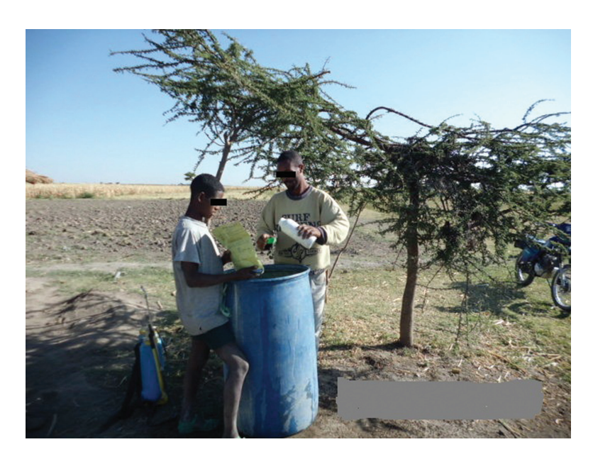
Figure 3 Pesticide mixing practices in small scale irrigated areas.

in alternatives to chemical pesticide (Ibitayo, 2006) and 84% did not see an alternative for chemical pesticide use (Stadlinger et al. , 2011).