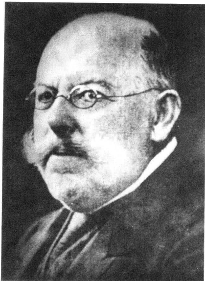
Fig. 1. Prof. Friedrich Löffler