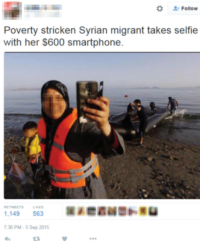
Figure 1. “Poverty stricken Syrian migrant takes selfie with her $600 smartphone” @DefendWallSt

gap in the scholarship – especially pertinent for young connected migrants – demands our attention because transnational connectedness with family members’ overseas challenges European borders and normative expectations of family governmentality as well as dominant representations of normative (white, western, middle-class) technology use. This article argues “young electronic diasporas” (ye-diasporas) (Donà, 2014) present us with a unique view on how Europe is reimagined from below, as people stake out a living across geographies. According to Donà, ye-diasporas are: