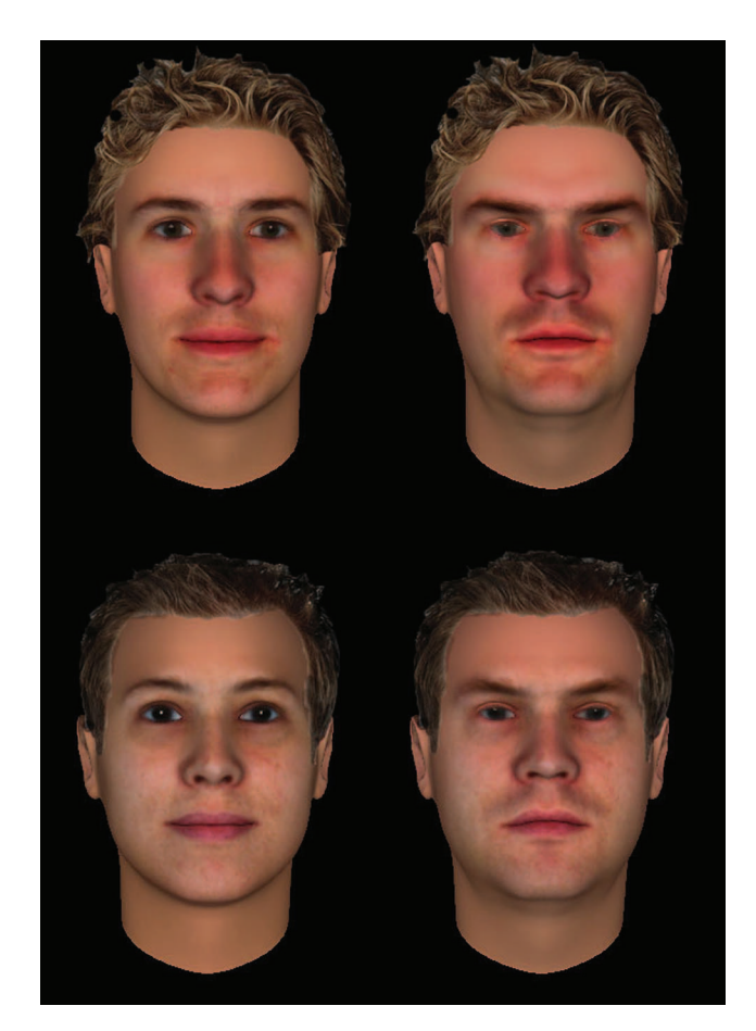
Figure 1. Trustworthy (left column) and untrustworthy versions (right column) of two speakers (rows). See the online article for the color version of this figure.

Stimuli. Pictures of trustworthy and untrustworthy looking faces were created using the FaceGen software development kit (Singular Inversions, Toronto, Canada). To manipulate trustworthiness, we used the FaceGen dimensions that were modeled by Oosterhof and Todorov (2008; Todorov, Dotsch, Porter, Oosterhof, & Falvello, 2013). Specifically, trustworthy and untrustworthy versions of eight male speakers were created through the following procedure. First, eight copies of the standard average face were morphed two standard deviations toward being male. Next, each face was morphed six standard deviations on a random dimension that was orthogonal to all known social dimensions to give each face neutral individual features (Said et al., 2010). To make the faces more realistic, each was also given an individual overlay texture that added details such as skin irregularities. In addition, we used Photoshop to give each face an individual haircut taken from pictures of real faces in the Radboud Face