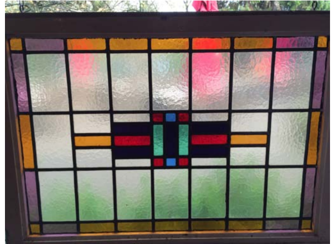
Fig. 5. Photograph of stained leaded glass decorative element

would cost 300-500 €/m 2 . The fact that an Electric Mondrian has a stained leaded-glass look with an additional benefit of charging mobile phones makes it attractive and a little higher cost compared to stained leaded-glass may very well be marketable. As such, the Electric Mondrian rather is a product integrated PV (PIPV) application [15] than a BIPV one.