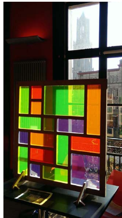
Fig. 2. Photograph of the 1-m 2 Electric Mondrian™, with the Utrecht Dom tower in the back.