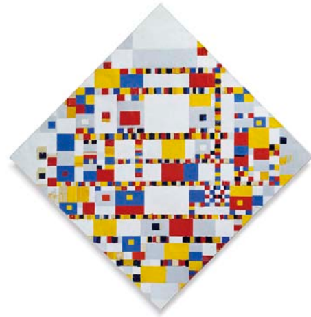
Fig. 1. Piet Mondrian, Victory Boogie Woogie (1942-1944), Gemeentemuseum Den Haag, the Netherlands.

The Electric Mondrian presently is a registered trademark, and public interest for such a decorative element as a potential replacement for stained leaded-glass warrants further development.