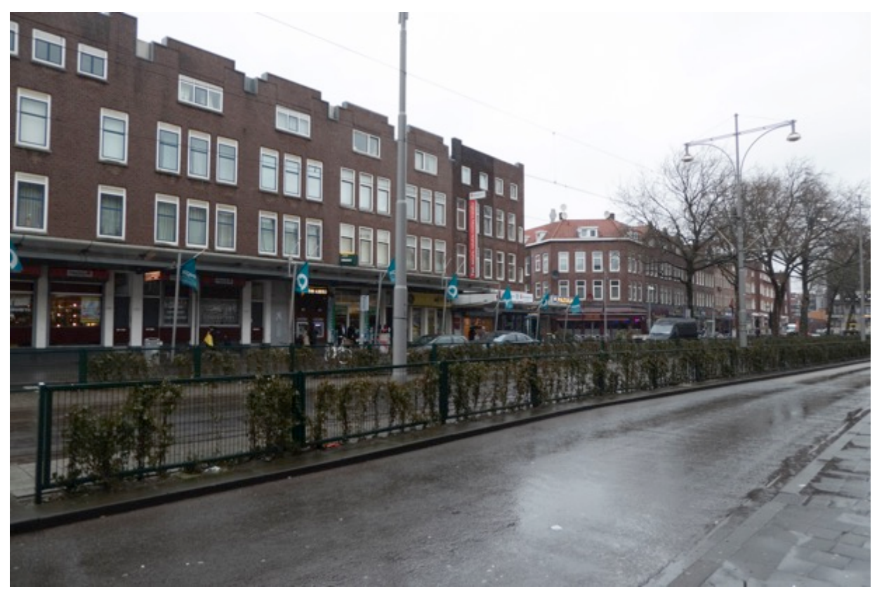
Figure 4. A fence separates the two sides of a shopping street in Feijenoord

"The Municipality collaborates with large-sized businesses for their vacancies. Why not give the regional businesses a chance? ... It's because they work with procurements."