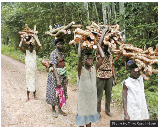
Degradation often has different driving forces to deforestation: collection of Acacia pentagona in Ghana.

Apart from selective logging, little analysis has been made of the impacts of these processes on the loss of forest biomass and the time needed for regrowth. Further, almost all studies have focused on humid tropical forests. However, degradation of dry forests by extraction of fuelwood is often more pronounced than by commercial timber harvesting (Skutsch and Trines 2008), and this is important since dry forests are generally more heavily populated than rainforest. While the carbon content of