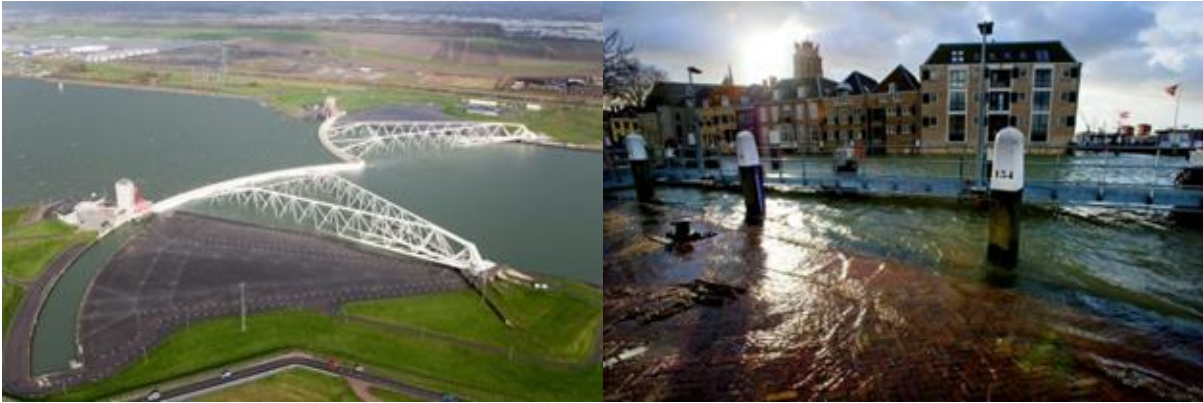
Photos: Stormvloedkering, https://beeldbank.rws.nl , Rijkswaterstaat / Joop van Houdt; image of Dordrecht, http://www.preventionweb.net/applications/hfa/lgsat/en/image/href/5474