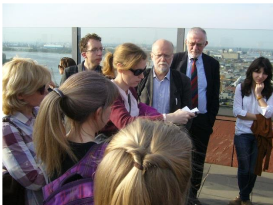
Plenary consortium meeting and Academic Master Class (including field trip) in Antwerp, Belgium, 2-4 April 2014.