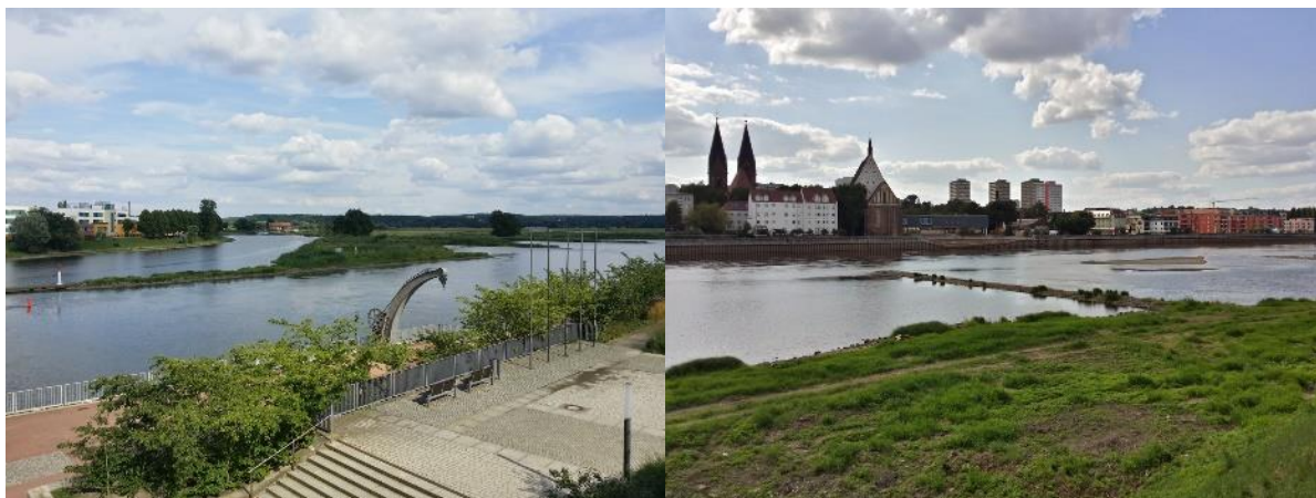
Odra River in Słubice.