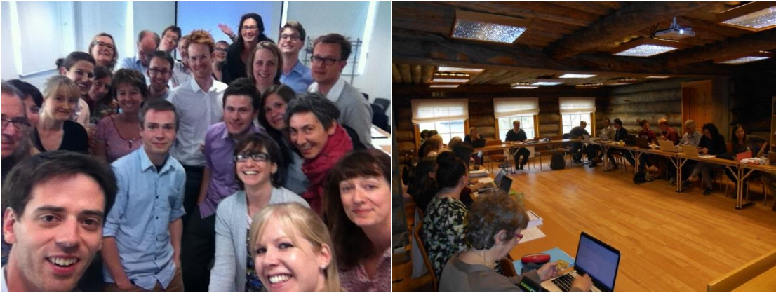
Pictures: group photo at STAR-FLOOD's Academic Master Class in London, 4 and 5 July 2014 (left) and the plenary consortium meeting in Luleå, Sweden, 4 and 5 June 2015 (right).