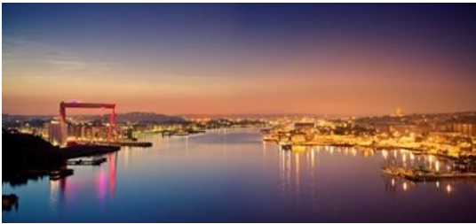
Harbour of Luleå

Strategies and help overcome fragmentation. Chapter 5 discusses the actors involved in flood risk governance and the division of responsibilities between public and private actors, including citizens. Chapter 6 is about observed diversification of rules and regulations relevant for flood risk governance and the challenges related to the development of appropriate rules that are enforceable and enforced. Chapter 7 discusses the resources needed to make flood risk governance more resilient. In chapter 8, our evaluation of the resilience, efficiency and legitimacy of flood risk governance is provided. Implications for policy and law at the European, national and regional level are discussed in chapter 9. Finally, chapter 10 provides our concluding remarks. For a detailed justification and underpinning of each conclusion, each chapter refers other relevant STAR-FLOOD deliverables as well as existing scientific literature.