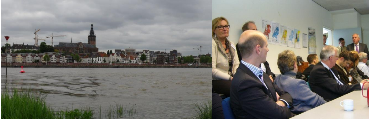
Pictures: city of Nijmegen (left); and field trip to Regional Water Authority 'De Stichtse Rijnlanden' (October 2012, right).