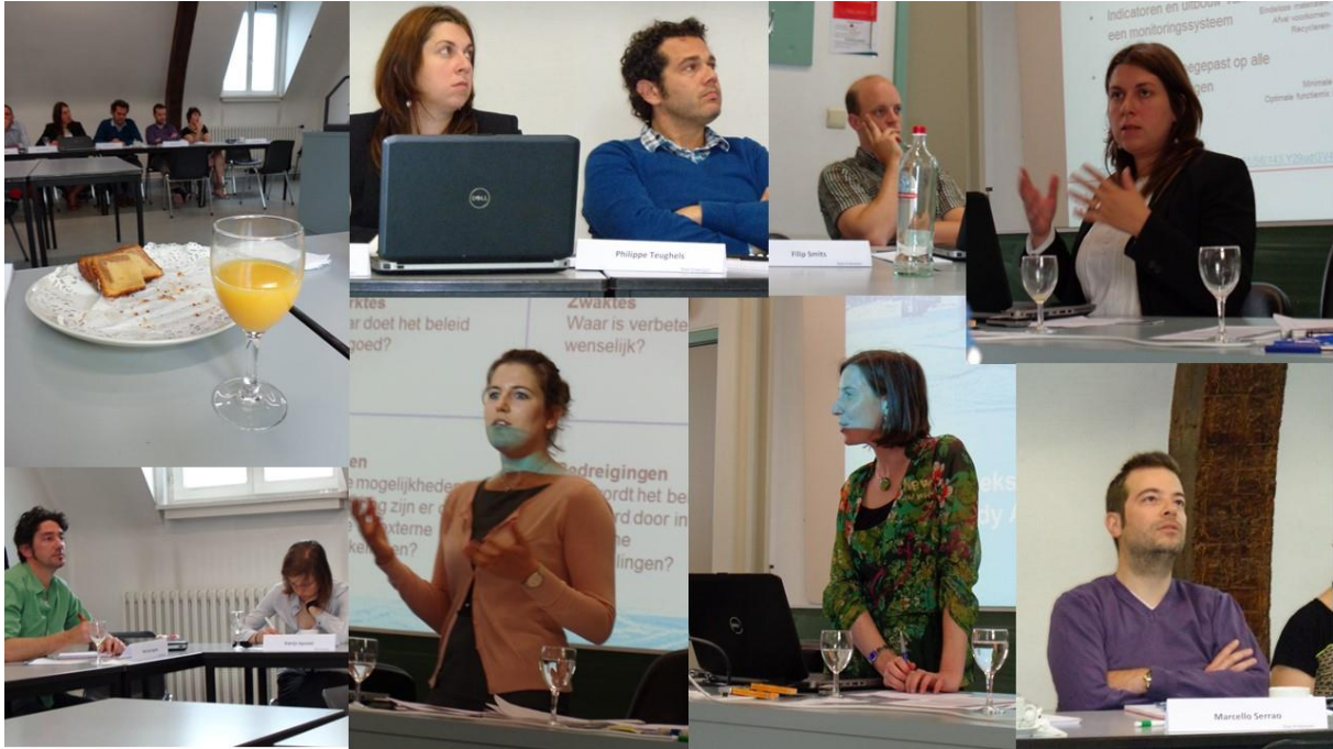
Case study workshop in Antwerp, 19th June 2014