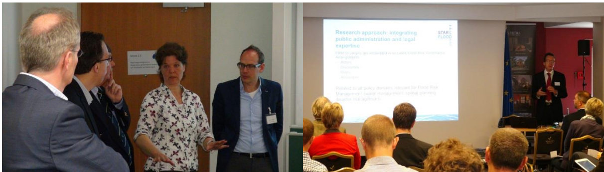
Pictures: STAR-FLOOD session at the knowledge conference of the Dutch Delta Programme, Wageningen, 23 April 2013 (left) and presentation at STAR-FLOOD's first expert panel, Brussels, 16 October 2013 (right).