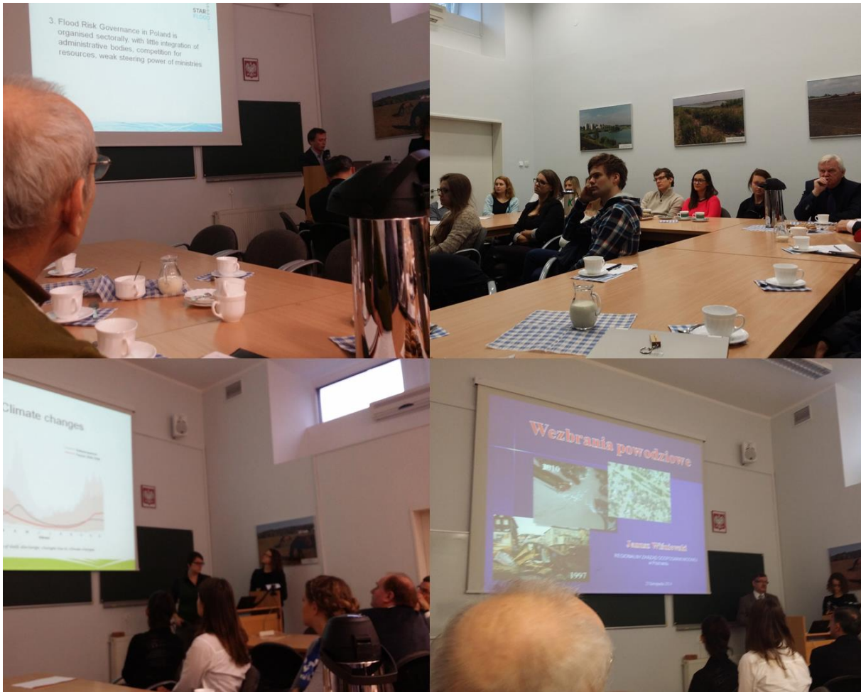
Case study workshop in Poznań, Poland, 25 th June 2015.