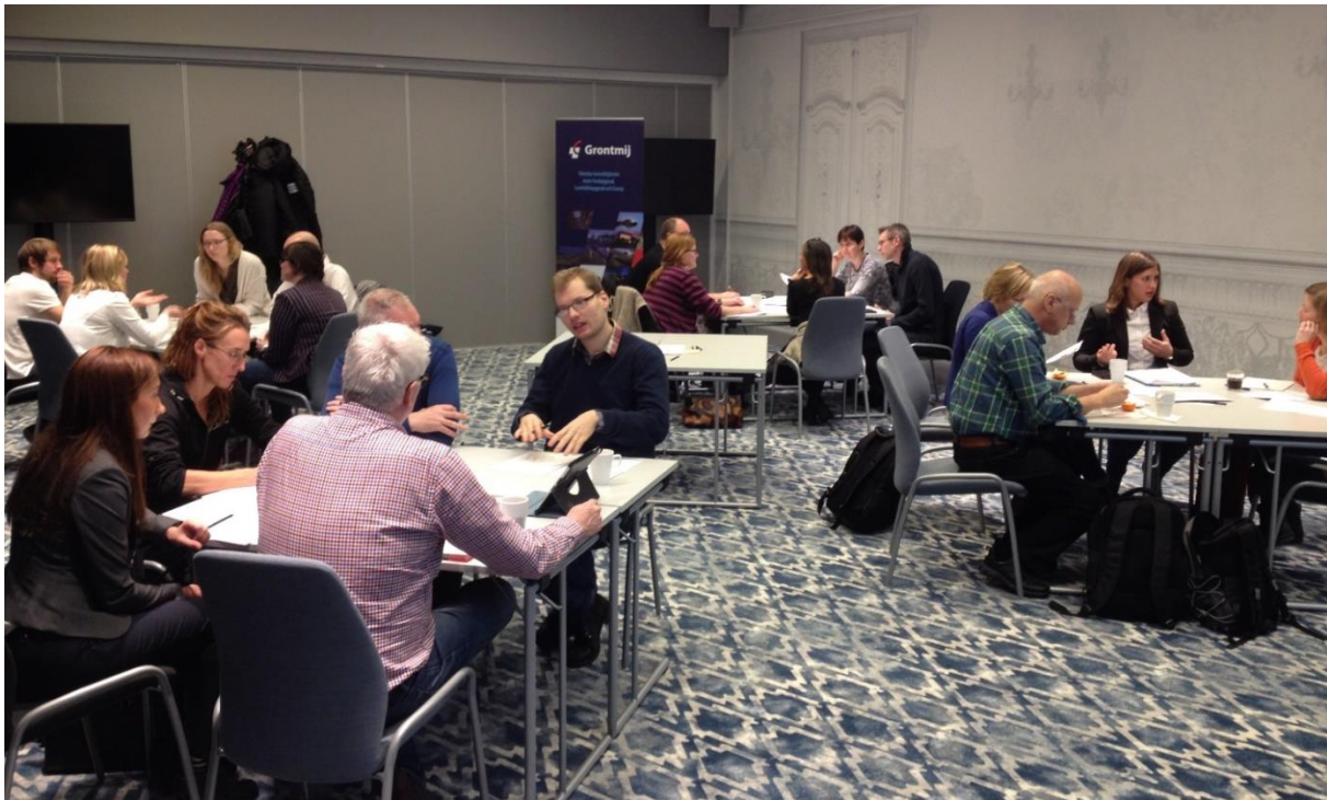
Swedish case study workshop (Göteborg, 28 th February 2015)