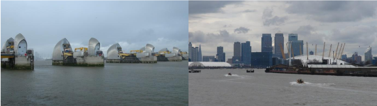
Photo left: Thames Barrier (Dries Hegger, 2013); photo right: City of London (Dries Hegger, 2013).