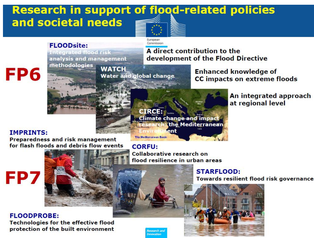
Figure 2: overview of integrated projects funded by the European Commission.

For a long time a natural and technical science perspective has dominated the research on Flood Risk Management. When the Floods Directive (Directive 2007/60/EC) was being developed, the directive text was drawing significantly on findings from projects carried out within the Sixth Framework Programme (FP6) in the period 2002-2007 (Kundzewicz et al. 2015, submitted). In particular, the FLOOD-site project provided a scientific foundation for the directive text adopted in 2007. Subsequent projects provided enhanced knowledge on climate change impacts, e.g. the WATCH project and regional assessments, for instance in the Mediterranean area with the CIRCE project (ibid). In FP7 in 2007-2013, research was more focused on implementation issues, e.g. related to improved early warning of flash floods with the IMPRINTS project, and disentangling the notion of flood resilience within the CORFU project (ibid. See also: Quaeuvauviller 2011). A graphical depiction of the interrelationships between the projects is provided in figure 2.