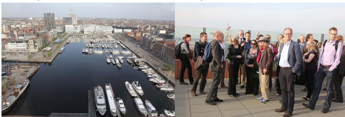
Pictures: a view of Antwerp (left;); excursion to the city of Antwerp (right).