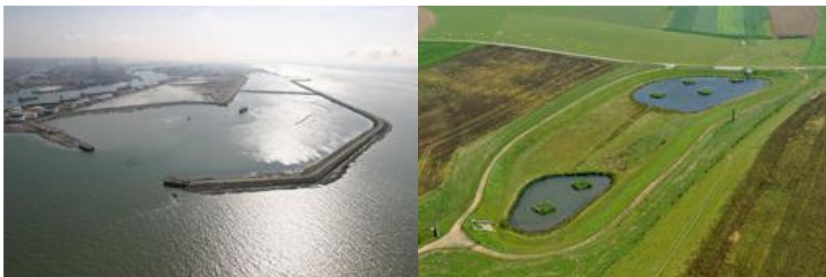
Left photo: The marine wall, protection for both the harbour and the city of Le Havre. ; right photo: basins in the upstream section for mitigation strategy.

Prof. Peter Driessen – STAR-FLOOD project coordinator, on behalf of all contributors