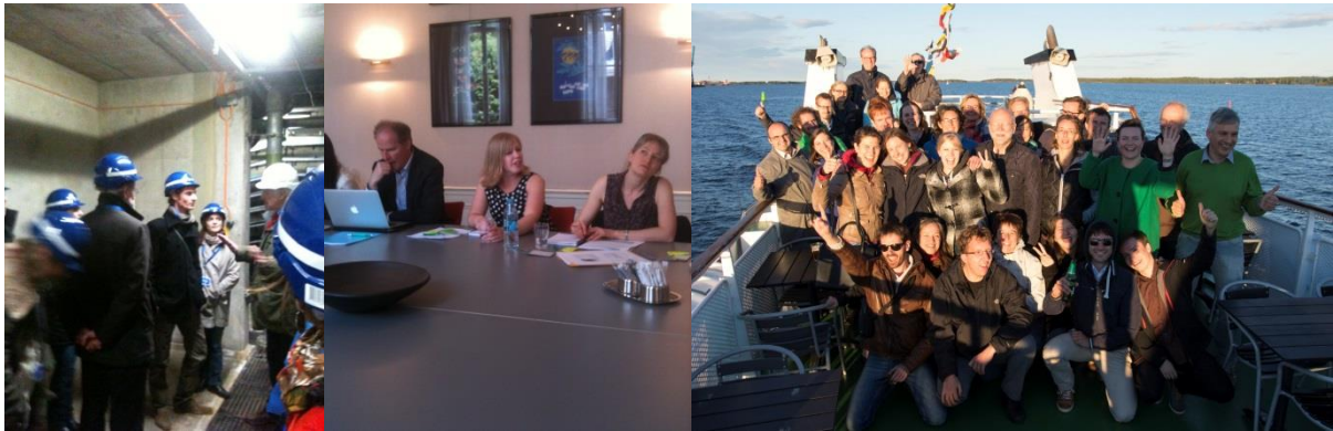
Pictures: visit to Thames Barrier (April 2013); consortium meeting in London (April 2013); boat excursion in Luleå, June 2016.

Pettersson et al. (in preparation). Design principles for improved legitimacy of flood risk governance in Europe.