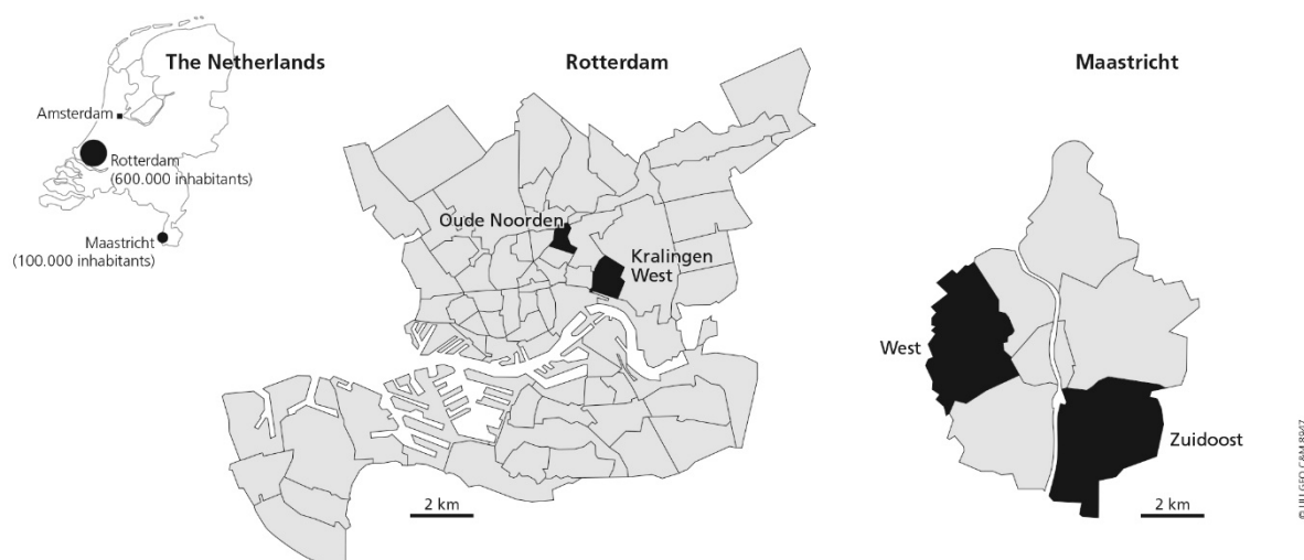
Figure 1. Selected neighborhoods in Rotterdam and Maastricht.