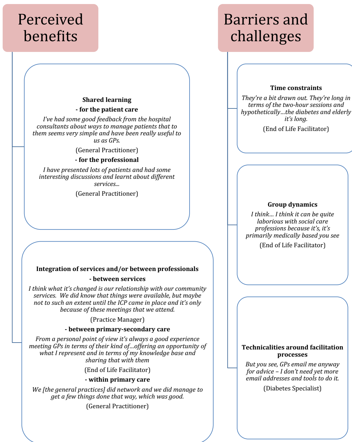
Figure 1. Examples of health professionals' narratives of benefits and barriers of participating in the multidisciplinary group meetings.