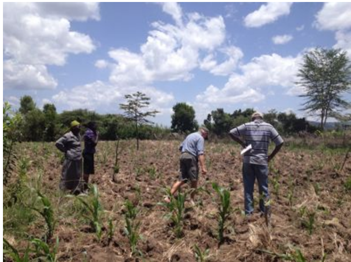
Out-grower training in Kenya

Certification or the use of standards and guidelines are a further issue to consider in this context. Certification or compliance with a reputable set of standards is more and more a necessary condition for access to the value chains that connect local producers with world markets, or rather, the more important buyers and exporters. Concerns for food safety, but also ethical considerations on the environmental impact and the social conditions of production have made retailers in major markets increasingly anxious to safeguard their companies from reputation risk or worse. These risks are countered by imposing strict standards to producers and handlers upstream in the value chain. Certification of producers and monitoring compliance are generally outsourced to specialised firms and organisations. While this makes eminent sense from the perspective of product and process quality, certification does create barriers to inclusive business models.