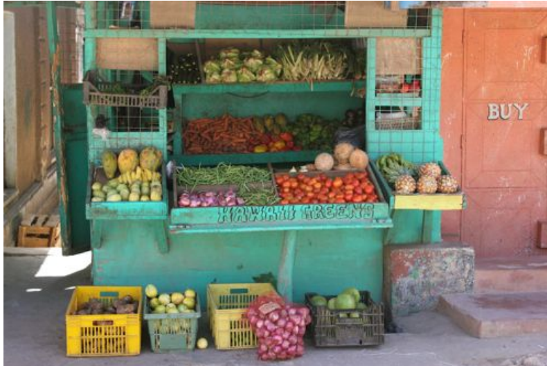
Local food market in Kenya

Africa. 2 Even when setting up a new agribusiness does not impact existing land users, then it still limits the availability of land and water resources for local people in conditions of considerable population growth, as is usually the case. These are thorny issues without straightforward answers – an avoidance of external investment in farming is not necessarily better, considering the low productivity prevailing in African agriculture and the