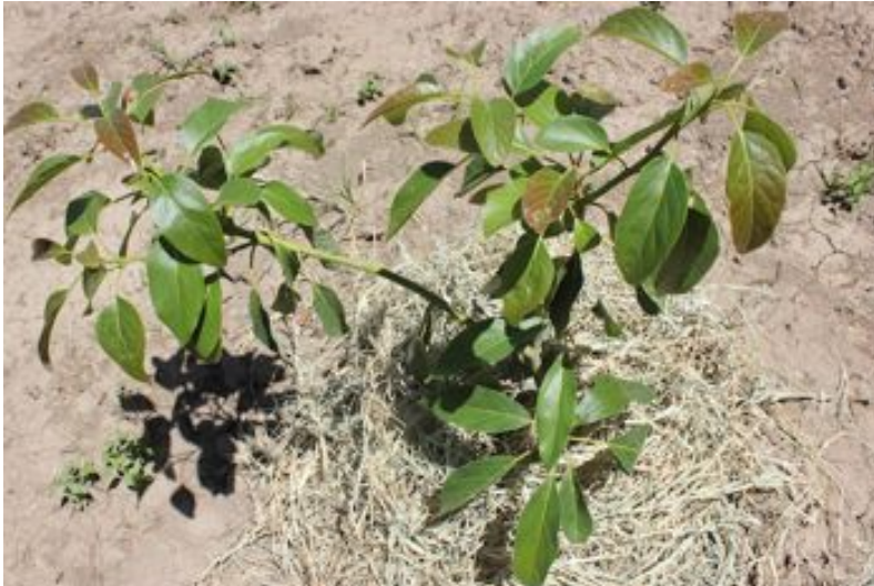
Kenya, young avocado tree

All entrepreneurs interviewed are male and many of them have been in Kenya for a couple of years and plan on staying for the nearby future. Interviewees are either owner or (general) manager of the companies in which they worked. Three of the interviewed entrepreneurs were born in Kenya and have lived in the country their whole life; two of these three entrepreneurs have double nationalities (Kenyan with another nationality). Older entrepreneurs tend to have more agricultural focused schooling and work experience while