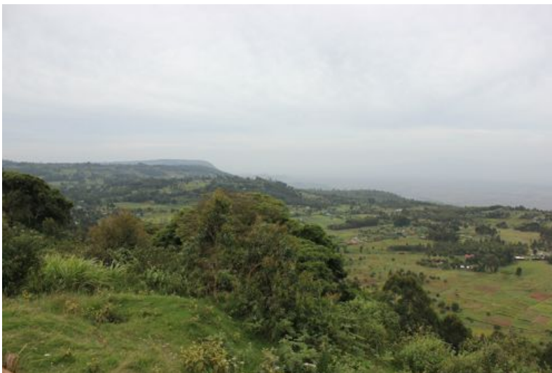
Central Rift Valley, Kenya

Contract farming or out-grower schemes are often considered a good option for spreading benefits even when the investor's business model cannot be repeated locally. A lead firm organising a value chain locally in such a way that many local small producers may contribute their output while central coordination and aggregation to a sufficient scale level is done by the lead firm is an attractive proposition. It reaches out to many and does not displace people from their productive assets such as land. Nevertheless, results with out-grower schemes are often disappointing. There is a considerable effort (cost) involved in maintaining contractual arrangements (even when standardised) with hundreds or thousands of small suppliers. Monitoring of product quality and process standards is difficult