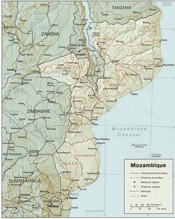
Map 3 Mozambique

and phased out after the 1990 constitution, left the country in bad shape with little infrastructure and no private entrepreneurship to speak of. Nearly all business people from the colonial era had left, and there is not much in terms of a local entrepreneurial base. While the nineties have seen basic reconstruction and institution building, it is roughly since the turn of the millennium that Mozambique is building an economy based on private entrepreneurship.