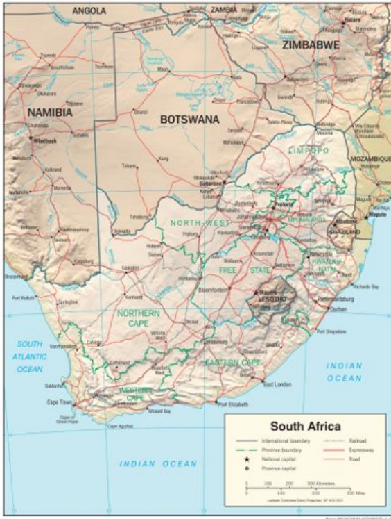
Map 5 South Africa

the South African farmers do not receive any form of subsidy, which makes competition with Europe a big challenge. Competition from other African countries like Kenya and Tanzania is also increasing, and these countries often have a more favourable and temperate climate. Labour costs in these countries often are lower than in South Africa, and as they are closer to popular export markets such as the US and Europe, they have a definite competitive advantage. Another hindering factor comes from other countries which dump their cheap produce on the South African market. An example of this is the poultry produce from Brazil, which is of very low quality and price.