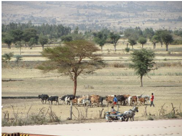
Debre Zeit, Ethiopia

Africa's competitive advantage is often in agriculture, with its relatively low population densities combined with large areas of arable land that are not used very intensively. Africa's land and population characteristics could assist the continent in reaching much higher levels of productivity, if more investment and better farming methods can be introduced in a sustainable way. Moreover, in international development cooperation and Dutch policy in particular, there is a renewed emphasis on the role of the private sector in fostering development. At the same time there is increasing recognition that the private sector should live up to responsible business standards so that the social and environmental risks of doing business – for example in terms of competition for land and resources with local populations - are lowered. This has led to a new frontier where businesses are no longer considered to be stand-alone operations intent on making profits without further societal and environmental commitments.