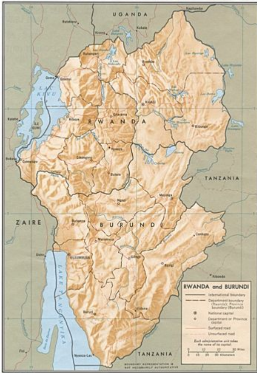
Map 4 Rwanda and Burundi

and fragmented productions. On the other hand, the sector is transforming substantially as it has recently shown an upscaling and professionalization of production and a growing involvement of foreign direct investments. The second reality is closely related to Rwanda's development road map Vision 2020, which will be discussed more in detail in the next section.