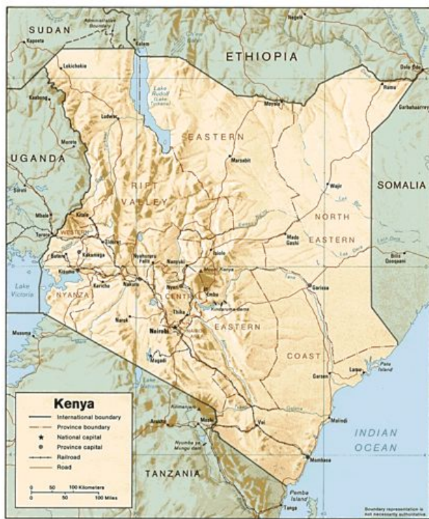
Map 2 Kenya

negatively affected Kenya's investment climate. However, the recent relatively peaceful re-elections in March 2013 will further restore trust in its political stability and economic growth. Many of the Dutch entrepreneurs said the March 2013 elections would be a sort of test; a number of entrepreneurs postponed making important investments until after the elections.