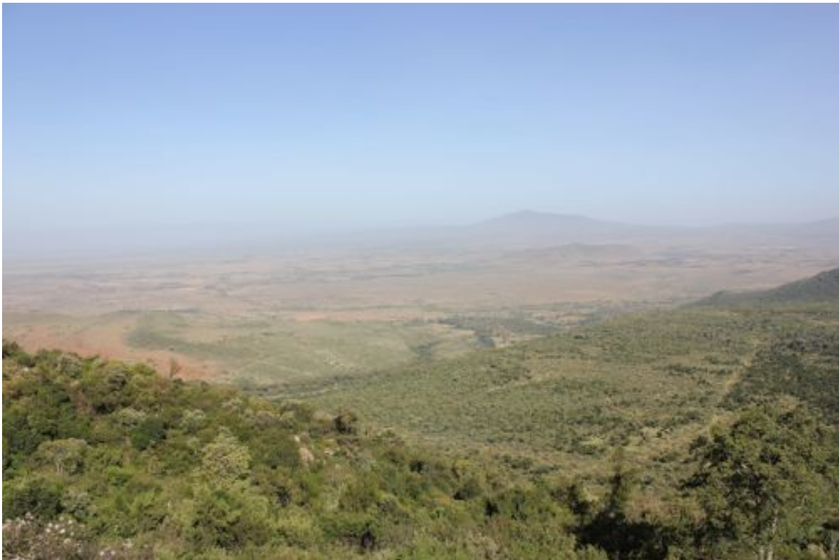
Kenya, Nairobi to Naivasha

Regarding the use of natural resources, most entrepreneurs view the environmental impact of their activities as very small. They stress that they own very little land, or that they only used the land for a limited amount of time. In case the farmers use water for irrigation they usually obtain this from surface water, ground water or rainfall and do not really observe any competition about this water with local communities themselves. When asked about this, they indicate that the Water Board in Kenya is in charge of equal distribution of water sources. At the same time, entrepreneurs say that the Water Board monitors very limitedly; some entrepreneurs note they have never seen anyone from the Water Board since they started their business. A few entrepreneurs are very aware of environmental aspects of their businesses and actively try to contribute to better natural resource management, for example by constructing a water catchment area or by making use of renewable energy. Another contribution Dutch entrepreneurs mention themselves is the fact that they bring more energy-efficient and less polluting technology and working methods to Kenya as compared to existing practices in the country.