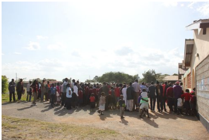
CSR project in Kenya: establishment of a health centre

businesses tend to pay slightly more than the minimum wage, are concerned about the wellbeing of their workers, contribute to community projects and are interested in making their firm more water and energy efficient. These actions are also undertaken to optimise business results – which is a very reasonable motivation. At the same time, however, businesses can apply models that use natural resources intensively and in ways that are not necessarily sustainable in the