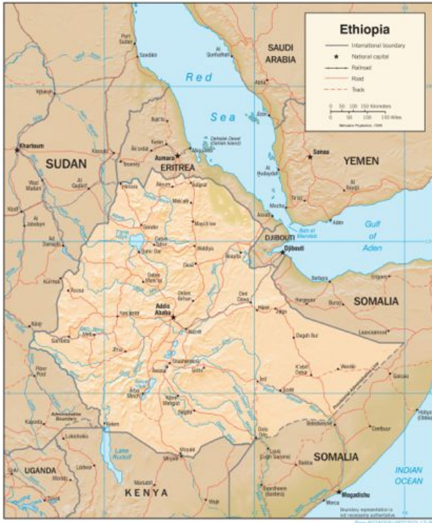
Map 1 Ethiopia

growth, though not as spectacularly successful as the Asian examples he tried to emulate as yet.