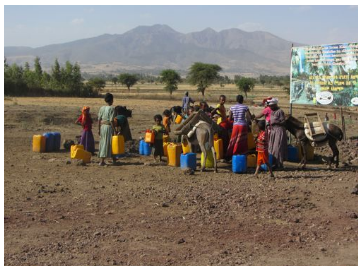
Debre Zeit, Ethiopia

A little over one-third of surveyed firms have benefitted from Dutch investment subsidies (PSI); this share will be lower among the flower growers. In terms of ownership, nine out of 22 firms are 100% Dutch owned enterprises, but in 12 cases part of equity is in Ethiopian hands. In one or two cases there is some