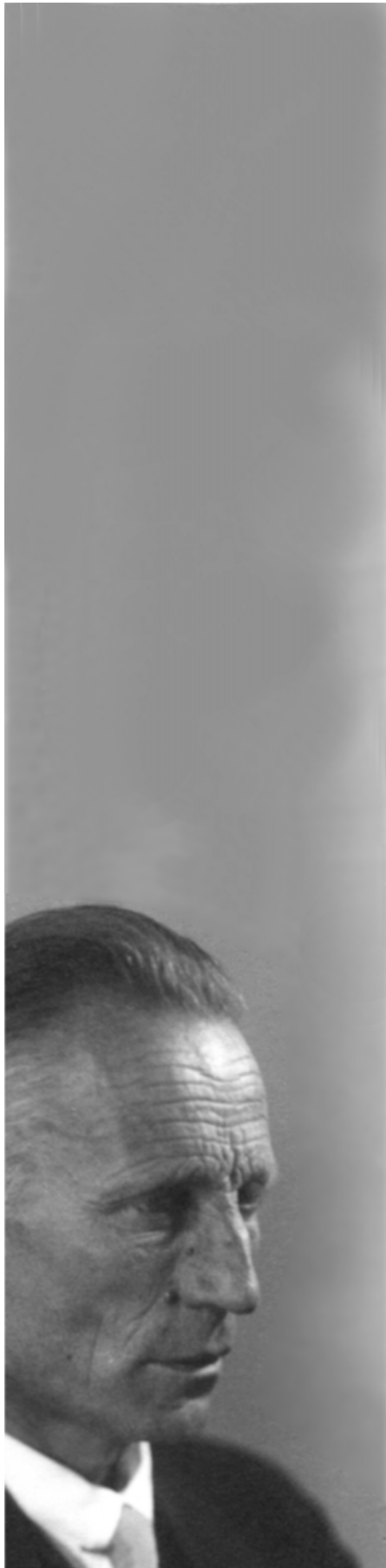
Luitzen E.J. Brouwer

haved at this occasion so excessive and obstinate, that he appears to me a man of pathological irritability (Einstein to Hadamard, 15 November 1930).”