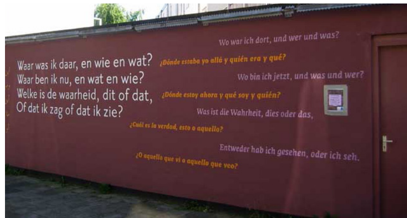
Figure 8 – Multilingual wall at Jacob Catsstraat

In the Jacob Catsstraat, named after the Dutch poet Jacob Cats, we find fragments of his poems spread over a couple of walls in about 10 languages. Figure 8 below shows a part of one of these walls including fragments in Dutch, German, Spanish and Arabic.