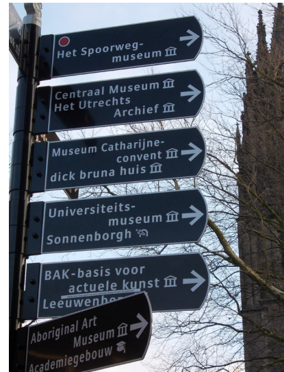
Figure 3 – Tourist street signs at Utrecht.

Tourists and non-Dutch speaking residents of Utrecht may find it difficult to use public transport around the city as this information is often given in Dutch only. In Utrecht Central Station all signs are given in Dutch only, except for information about international trains. Figure 4 below shows Utrecht Central Station and illustrates this point. Recently, though, we have witnessed, information being announced in both Dutch and English in a local train. Although the English used was a bit clumsy and unprofessional, it was a nice gesture from the conductor towards the non-Dutch speaking commuters and occasional users of this train. Usually information on the train is only given in English (besides Dutch) in international trains or trains to Schiphol Airport.