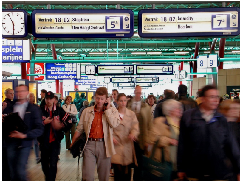
Figure 4 – Utrecht Central Station