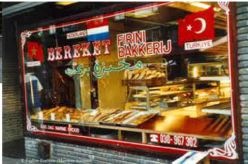
Figure 6 (left) – Entrance to Miffy's house, part of Utrecht Centraal Museum