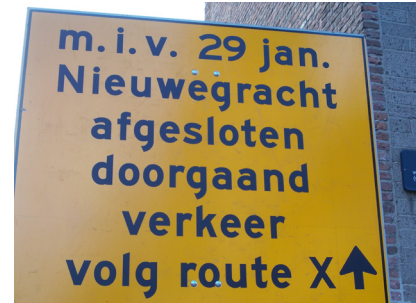
Figure 5 – Dutch sign at Domplein, Utrecht.

Despite these monolingual examples, there are also many signs of multilingualism and multilingual signs to be found in Utrecht's 'cityscape'. So for instance, although public signs pointing at the museums are usually in Dutch only, most museums will offer information in at least two languages (guess...). Miffy's house, part of the Central Museum, even uses Japanese, because of its popularity among Japanese tourists, illustrated in figure 6.