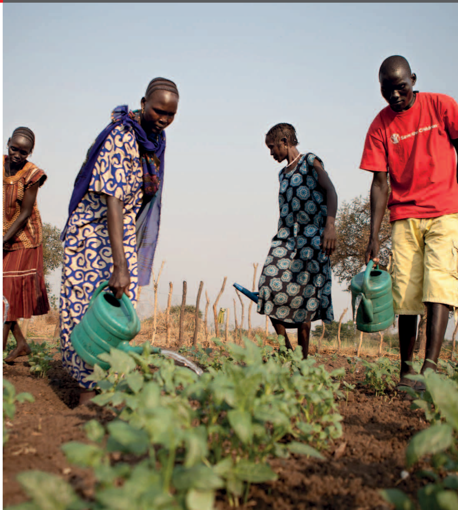
Pictures from Pagak, Upper Nile. This is one of the locations where Save the Children is implementing DCR activities. The pictures were taken at one of the demonstration plots, supported by DCR. Save the Children uses the plots to train the targeted farmers on agricultural techniques.

This research was commissioned by the Advocacy Working Group (AWG) of the Dutch Consortium for Rehabilitation (DCR) with the aim to strengthen knowledge and understanding within the Consortium regarding stakeholder response strategies to fragility, to improve its response strategies in fragile contexts and to influence others to do the same. A better understanding of perceptions and responses can help improve approaches of all relevant actors towards various aspects of fragility.