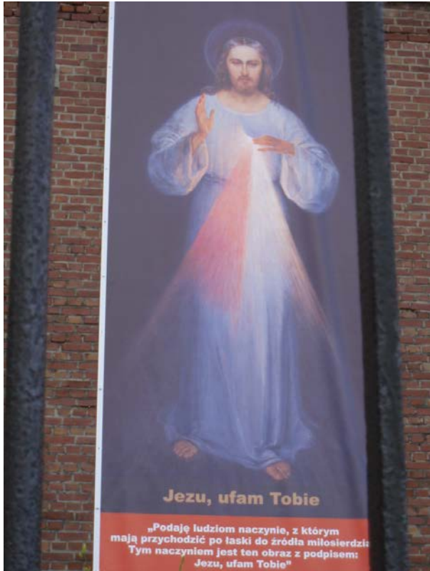
Flag with the Kazimirovski version of the Divine Mercy image hung over the sanctuary's wall during the pilgrimage of Radio Maryja in 2009.

Radio Maryja is also a supporter of the Divine Mercy devotion and hangs a large flag with the Divine Mercy image on the wall of the monastery immediately below the outside altar during their pilgrimages. In 2009, this image was the older Kaszimirowski version. As already mentioned, this version was promoted by Father Sopoćko as the manlier, more appropriate version because of the following signifiers: his head is not tilted, but, instead, Jesus looks the viewer straight in the eye; the long hair almost vanishes in the dark background; the beams radiating from the heart are much shorter so that they remain largely within the confines of the robe and bear hardly any resemblance to Marian images; the wound of the heart is a fiery ball of light; the beard is more pronounced, so that it also covers the throat; his feet are wider apart and the body is more erect; the fingers are shorter, the eyes are smaller and he appears to be slightly tanned.