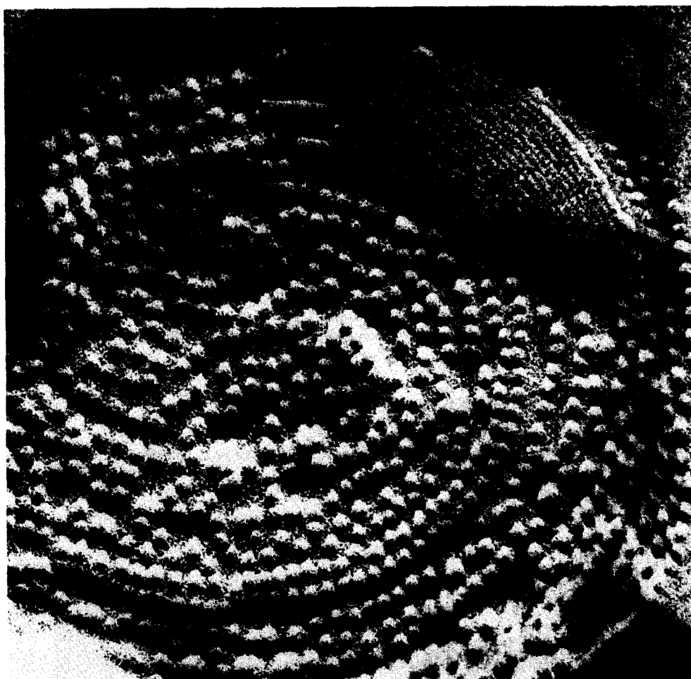
Fig. 2. Freeze-fracture micrograph of a mixture of dioleoylphosphatidylcholine/cardiolipid (from bovine heart from Sigma) at a ratio of 1 : 1, prepared by the Triton method as described in Ref. 5 in the presence of 2 mM \text{MnCl}_2 . Lipid concentration is 2 mM giving a \text{Mn}^{2+} /cardiolipin ratio of 2. Note hexagonal ( \text{H}_{\text{II}} ) cylinders with a diameter of about 100 Å at the transition from particles to hexagonal ( \text{H}_{\text{II}} ) cylinders with a diameter of 60 Å. Magnification \times 200\,000 .

Occasionally one can observe interesting transitory stages from lipidic particles to hexagonal II phases as shown in Fig. 2. There are three major points of interest. Firstly, two types of structure corresponding to an inverted cylinder ( \text{H}_{\text{II}} phase) lipid organization are present. One of these has a diameter of 100 Å, which is similar to the diameter of the lipidic particles, whereas the other has a