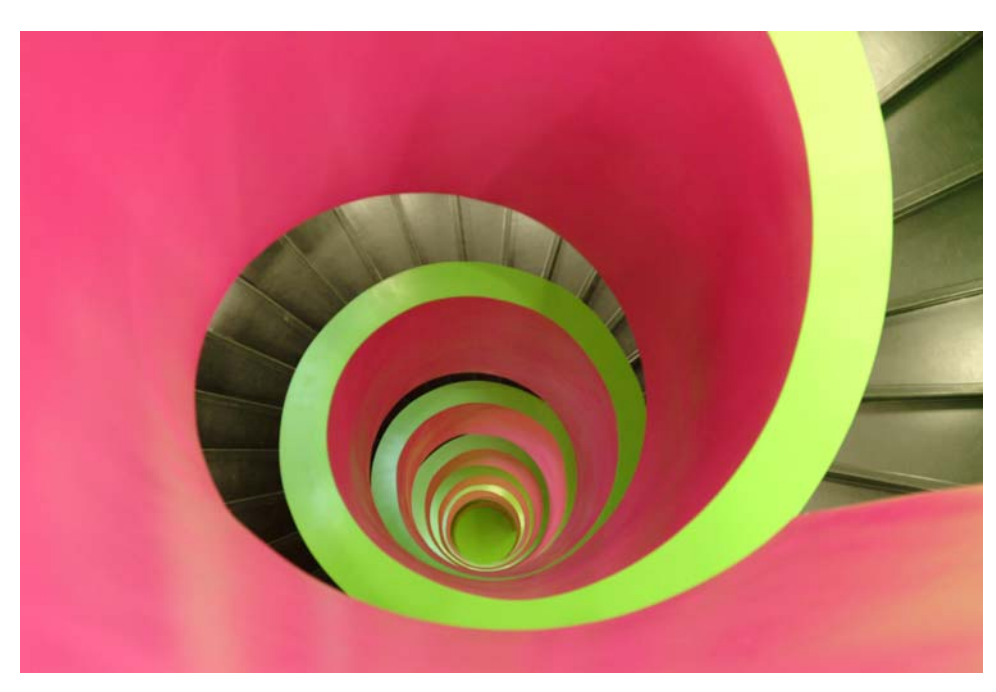
The staircase from the 6<sup>th</sup> floor

The library, with its underground stacks and specialized libraries distributed over six floors, is the focal point of the building's use: The individual specialized libraries are distributed over the various floors as follows with open stacks: Special library 1: the Arts, Economics, Law (1<sup>st</sup> underground level and 2<sup>nd</sup> floor); Special library 2: Architecture, Civil Engineering, Technology (3<sup>rd</sup> and 4<sup>th</sup> floor); Special library 3: Natural Sciences, Environment, Informatics/Computer Science (5<sup>th</sup> and 6<sup>th</sup> floor). The multimedia center occupies the 1<sup>st</sup> floor by itself with its facilities for multimedia production as well as for tele-teaching and tele-learning environments. On the ground floor, there is a lending desk, a service counter for all services of the ICMC/IKMZ and an exhibition area. In addition, on their appropriate floors, are the individual helpdesks of the specialized libraries as well as printing, copying and scanning stations. Moreover, in the 1<sup>st</sup> underground level, group and presentation rooms provide various possibilities for multimedia functions. In the 2<sup>nd</sup> underground level those stacks are located, which are closed for the public ( Mittler, 2006; Warnatz, 2005 ).