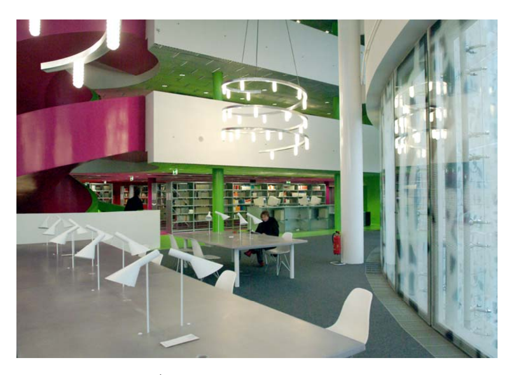
The reading room of the 2<sup>nd</sup> floor

The library, with its underground stacks and specialized libraries distributed over six floors, is the focal point of the building's use: The individual specialized libraries are distributed over the various floors as follows with open stacks: Special library 1: the Arts, Economics, Law (1<sup>st</sup> underground level and 2<sup>nd</sup> floor); Special library 2: Architecture, Civil Engineering, Technology (3<sup>rd</sup> and 4<sup>th</sup> floor); Special library 3: Natural Sciences, Environment, Informatics/Computer Science (5<sup>th</sup> and 6<sup>th</sup> floor). The multimedia center occupies the 1<sup>st</sup> floor by itself with its facilities for multimedia production as well as for tele-teaching and tele-learning environments. On the ground floor, there is a lending desk, a service counter for all services of the ICMC/IKMZ and an exhibition area. In addition, on their appropriate floors, are the individual helpdesks of the specialized libraries as well as printing, copying and scanning stations. Moreover, in the 1<sup>st</sup> underground level, group and presentation rooms provide various possibilities for multimedia functions. In the 2<sup>nd</sup> underground level those stacks are located, which are closed for the public ( Mittler, 2006; Warnatz, 2005 ).