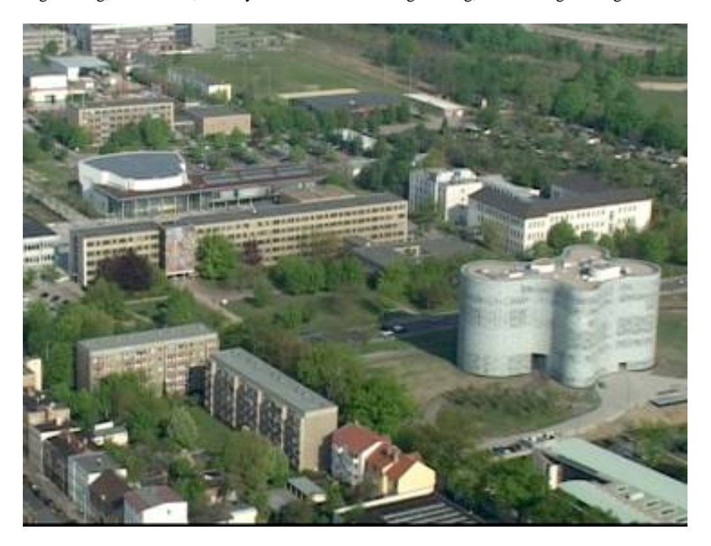
Aerial photography of the building [3]

Founded in 1991 the Brandenburg Technical University of Cottbus is the only technical university in the state of Brandenburg. The city of Cottbus is in the south-east of Brandenburg (ca. 120 km from Berlin). The university has around 5,000 students, with about 25% students from foreign countries. The profile of research and teaching covers 4 faculties with 130 professors and 24 curricula (BA/MA). The single faculties are: Faculty 1 - Informatics, Mathematics and Physics; Faculty 2 - Architecture, Civil engineering, Urban development; Faculty 3 - Engineering, Electrical engineering, Economics; Faculty 4 - Environmental engineering, Process engineering.