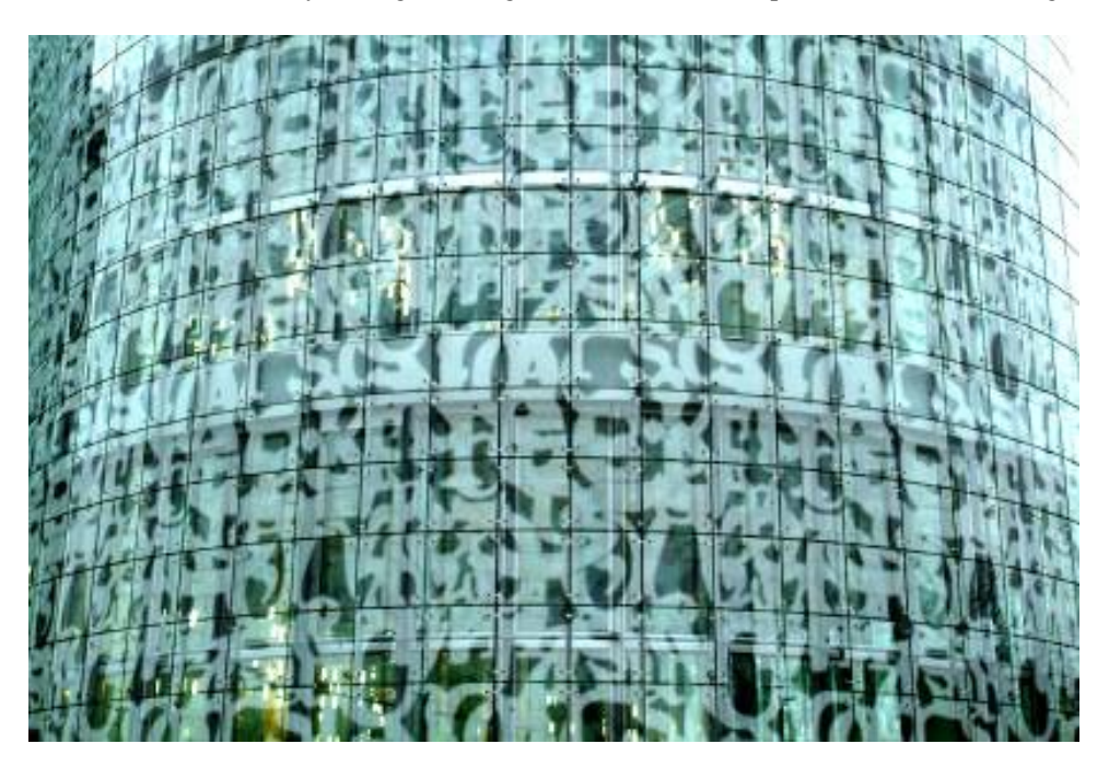
The facade in detail

new building has more than 700 workstations available (622 for users, 78 for staff). The user workstations are divided into 490 networked reader stations for notebook use, 61 pool stations, 54 research stations and 17 carrels. These facilities will be enlarged by around 100 workstations (diskless pc-stations) in the beginning of 2005. The amazing external architecture continues internally with a spiral staircase extending from the 1<sup>st</sup> to the 6<sup>th</sup> floor, and a striking color scheme (in vibrant yellow, green, magenta, red and blue) for parts of the floor covering and walls.