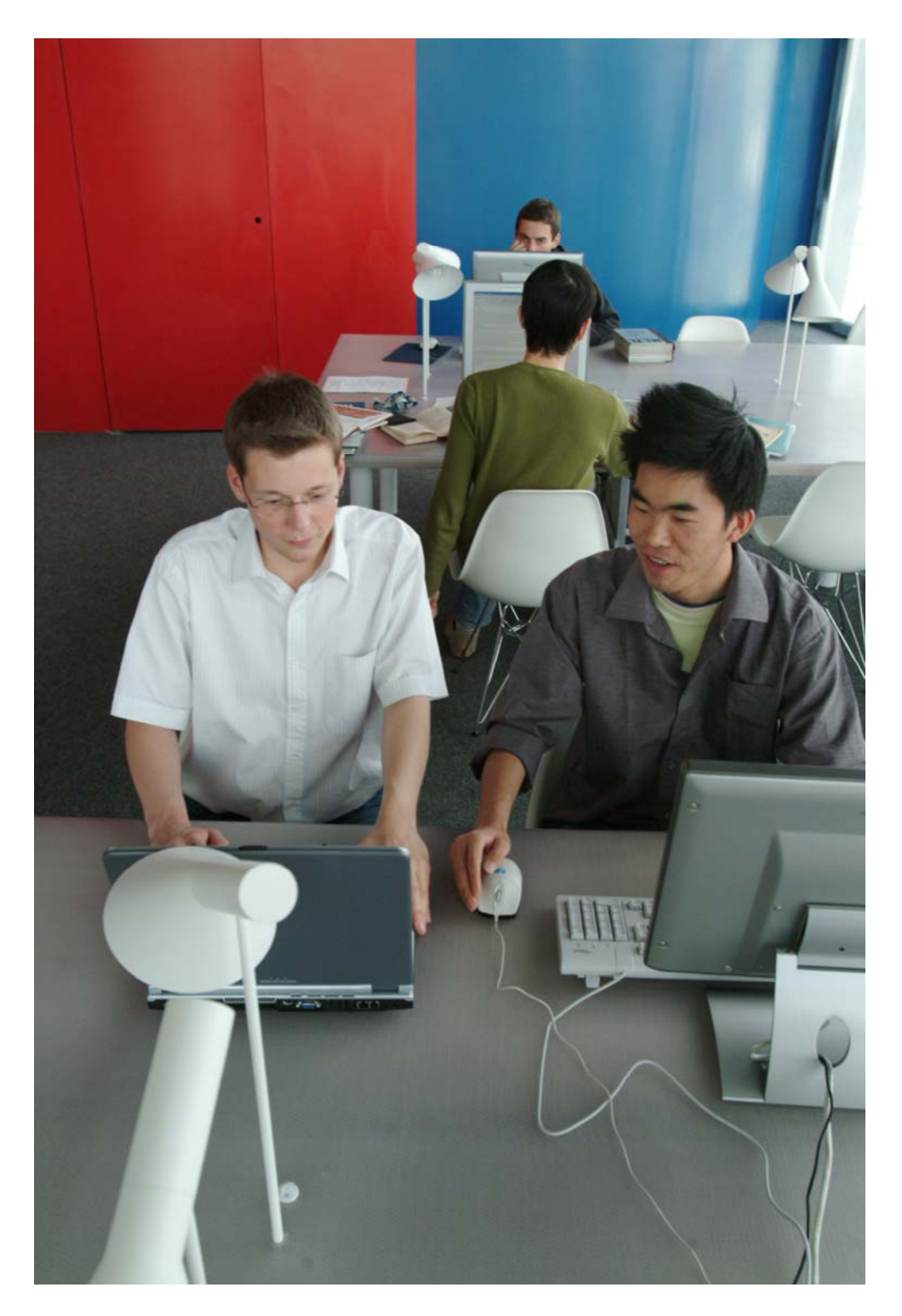
Working environment 2

An advisory board of the ICMC/IKMZ, still to be appointed, will collect and extend the participation and responsibilities of the formerly active committees and commissions (e. g. library committee). The advisory board will be composed as follows: the responsible vice president as the representative of the presidential council (chair), a representative from each of the (four) faculties, the chancellor as the representative of the administration, a representative for the scientific staff, a student representative. In addition, focus groups will be formed, as theme related working panels, in which representatives of the user and target groups of the ICM-services and ICMC/IKMZ staff will co-operate in solving problems promptly and in improving individual service provision.