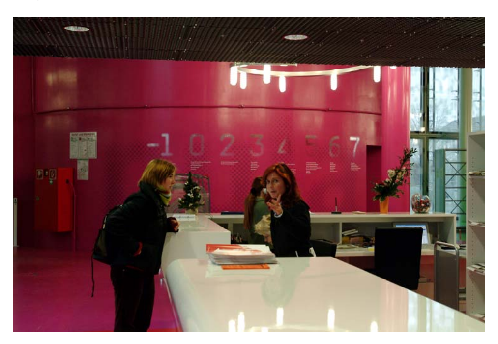
The lending desk

The main objective is to make available to the user and target groups of the ICMC/IKMZ the most homogeneous working environment possible as a 'work-flow based' service. In this connection, the analysis of the core processes in research, teaching and administration as well as the related support processes offered by ICMC/IKMZ are of great importance. In this way the service provision for education and research will be fulfilled more comprehensively and with more efficiency than by the many different initiatives of several service providers. Thereby, a converged institution like the ICMC/IKMZ has to act with a high level of flexibility to provide the benefits expected by the university and the faculties. With the further development of the ICMC/IKMZ there are good opportunities and conditions to establish an efficient e-learning resource center for the university and for the whole region ( Degkwitz , 2005 ).