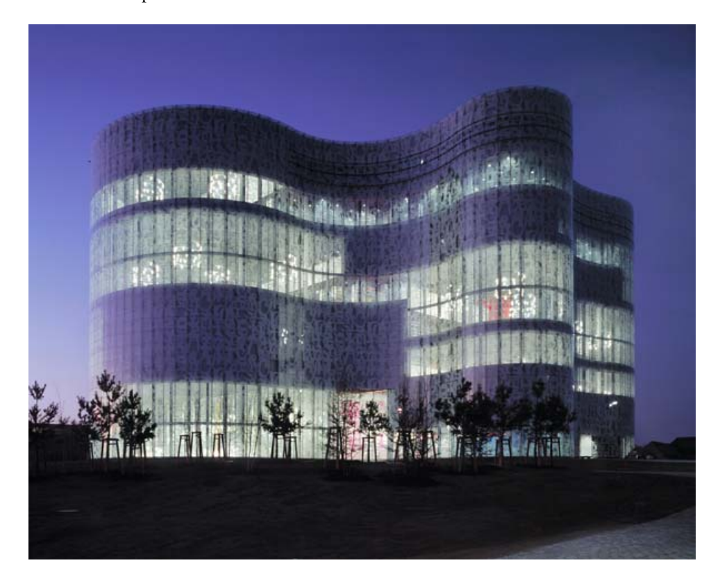
The building from the south west

which encourages and inspires everyone who is in touch with it.[7] Is there anything more encouraging than these new features of European culture?