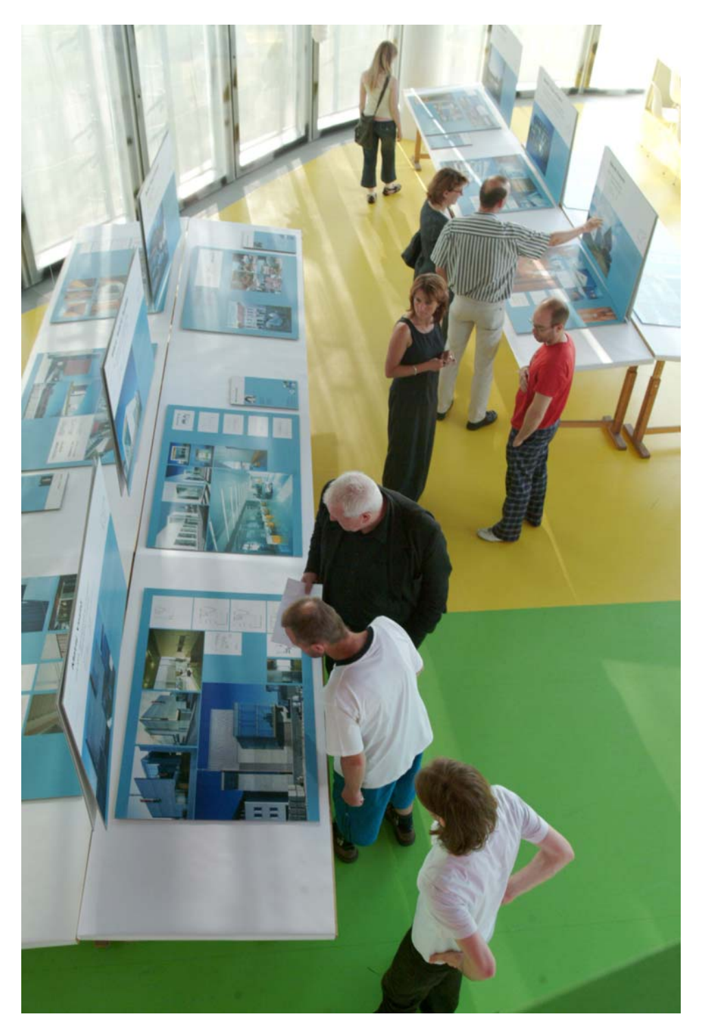
The exhibition area