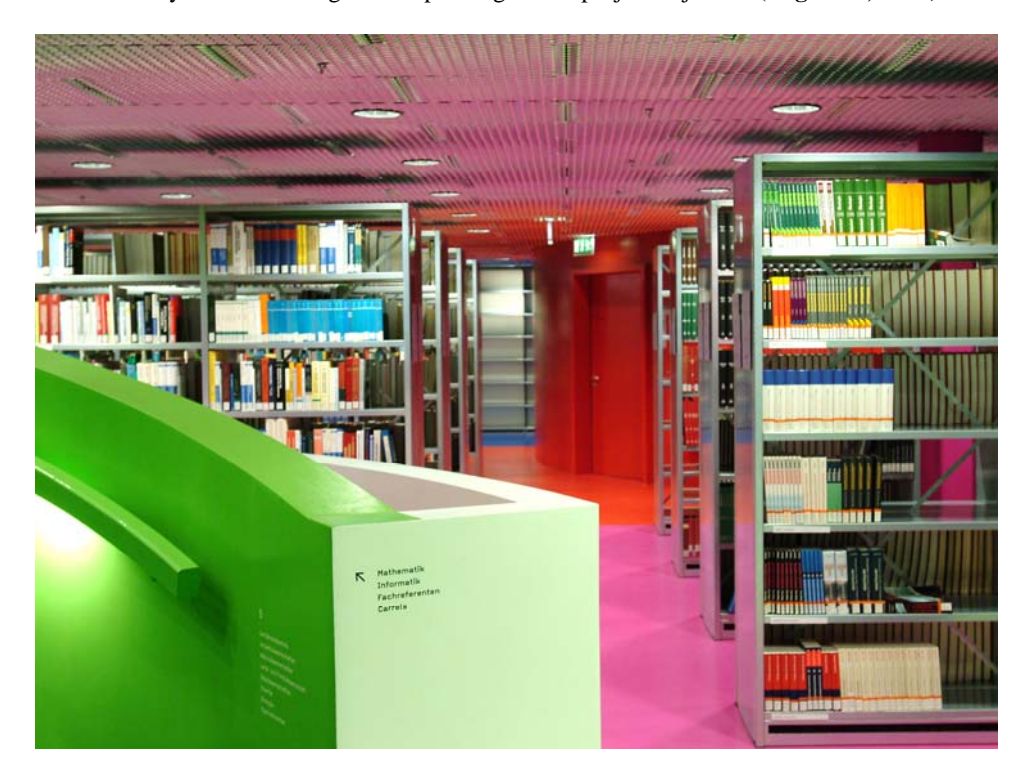
Subject library on the 5<sup>th</sup> floor

To avoid 'administrative overheads' the operational co-operation of the two management levels is deliberately oriented - in the sense of a common development objective - towards existing projects e.g. applying for third party funds, data processing equipment and networking of the new building, web-presence, helpdesk and service options within the framework of the front office. The technical implementation of these projects is carried out by the corresponding teams whose activity is short or long term depending on the project objective ( Degkwitz , 2005 ).