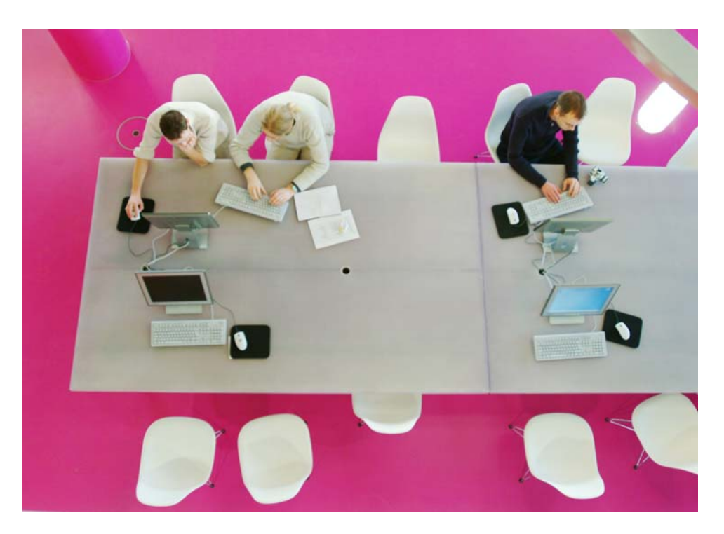
Working environment 1

To avoid 'administrative overheads' the operational co-operation of the two management levels is deliberately oriented - in the sense of a common development objective - towards existing projects e.g. applying for third party funds, data processing equipment and networking of the new building, web-presence, helpdesk and service options within the framework of the front office. The technical implementation of these projects is carried out by the corresponding teams whose activity is short or long term depending on the project objective ( Degkwitz , 2005 ).