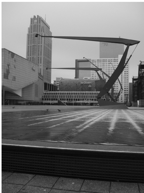
Figure 3. The Schouwburgplein is dominated by four light poles shaped like hoisting cranes. Cinema Pathé (left) and convention centre De Doelen (middle) frame the square.

To what extent can the Beurstraverse and Schouwburgplein be classified as either secured or themed public space? Figure 4 gives the ratings for the two public spaces on each of the six dimensions. It shows that the Beurstraverse can best be seen as a secured public space, since the coverage in the upper half of the circle is larger than the coverage in the lower part. Surveillance by means of CCTV is very common here; the management has installed no less than 68 cameras. The only street furniture present in the Beurstraverse consists of a few rubbish bins; there are no benches or ledges to sit on (see Figure 5). The rationale is that seating would distract customers from shopping and might encourage loitering, which could spoil the shopping experience. The Beurstraverse gets a medium rating on the 'regulation' dimension. Although it is privately owned and operated, its private security guards must depend on police backup; law and order in the