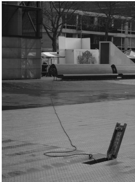
Figure 6. The pavement of the Schouwburgplein contains electricity hook-ups and metal hooks to facilitate events.