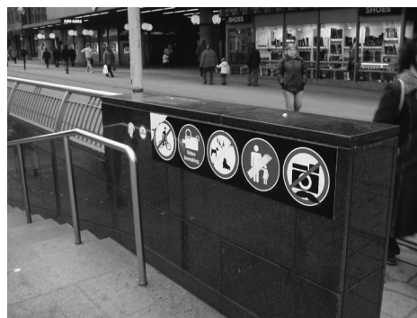
Figure 1. The Beurstraverse lies below grade and is visibly separate from its surroundings. Figure 2. Signs at the entrance of the Beurstraverse show tight restrictions.