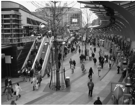
Figure 5. To avoid breaks from shopping in its luxury shops, the Beurstraverse offers no seating possibilities to its customers.