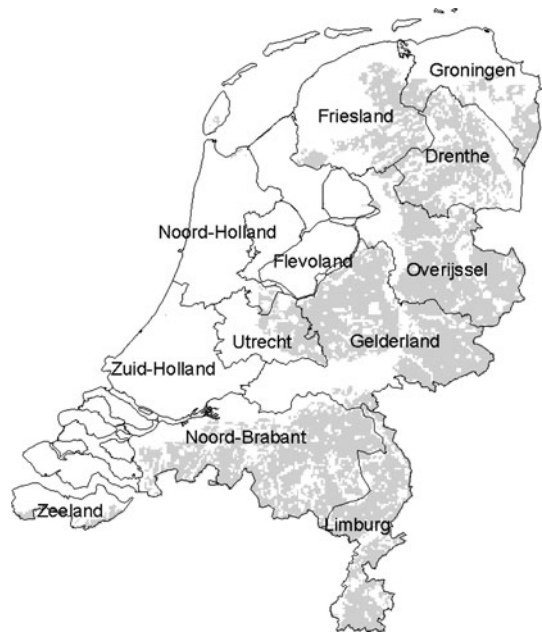
Fig. 3 Map of the Netherlands, provinces indicated, gray Pleistocene and older, rest Holocene