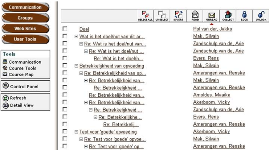
Figure 2 System for regular forum discussion (Blackboard) that was used in this study

document-centeredness of anchored discussion might naturally direct users’ collaborative intentions towards the processing of that text. According to Guzdial and Turns (2000), this could strengthen the link between discussion and study material and make the discussions more effective. Additionally, this automatic focus of students’ intentions and perceptions of the collaborative goal might also reduce the need for coordination of the collaborative process.